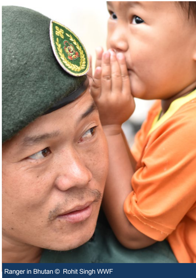
Ranger in Bhutan