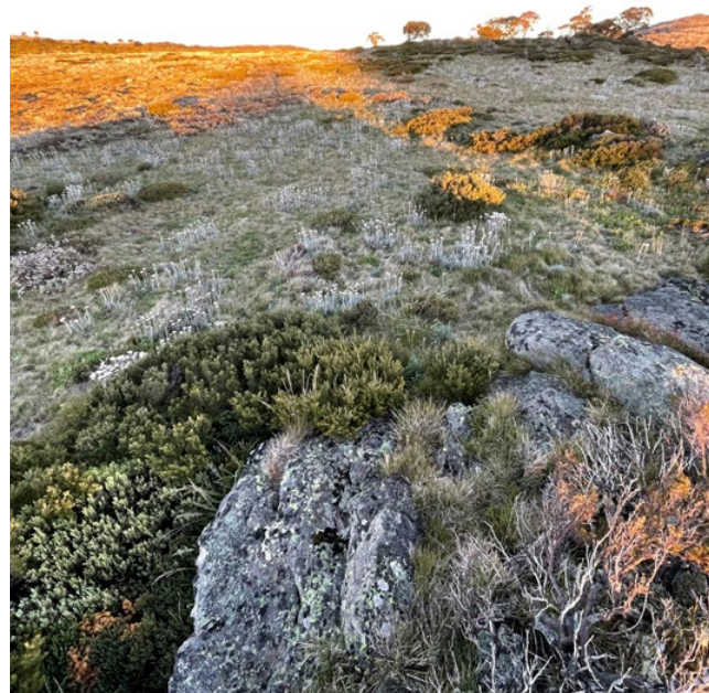
Alpine grasslands, Alpine National Park, Victoria, Australia

The IUCN World Protected and Conserved Areas Congress 2027 (WPC27) will be a critical milestone for global conservation, arriving at a time of ecological urgency and profound societal shifts. Since the last WPC in 2014, climate impacts, biodiversity decline, inequality and socio-political fragmentation have intensified. WPC27 is uniquely positioned to respond, bridging the final years towards meeting the 2030 targets of the Kunming-Montreal Global Biodiversity Framework with a bold agenda for the ensuing decade.