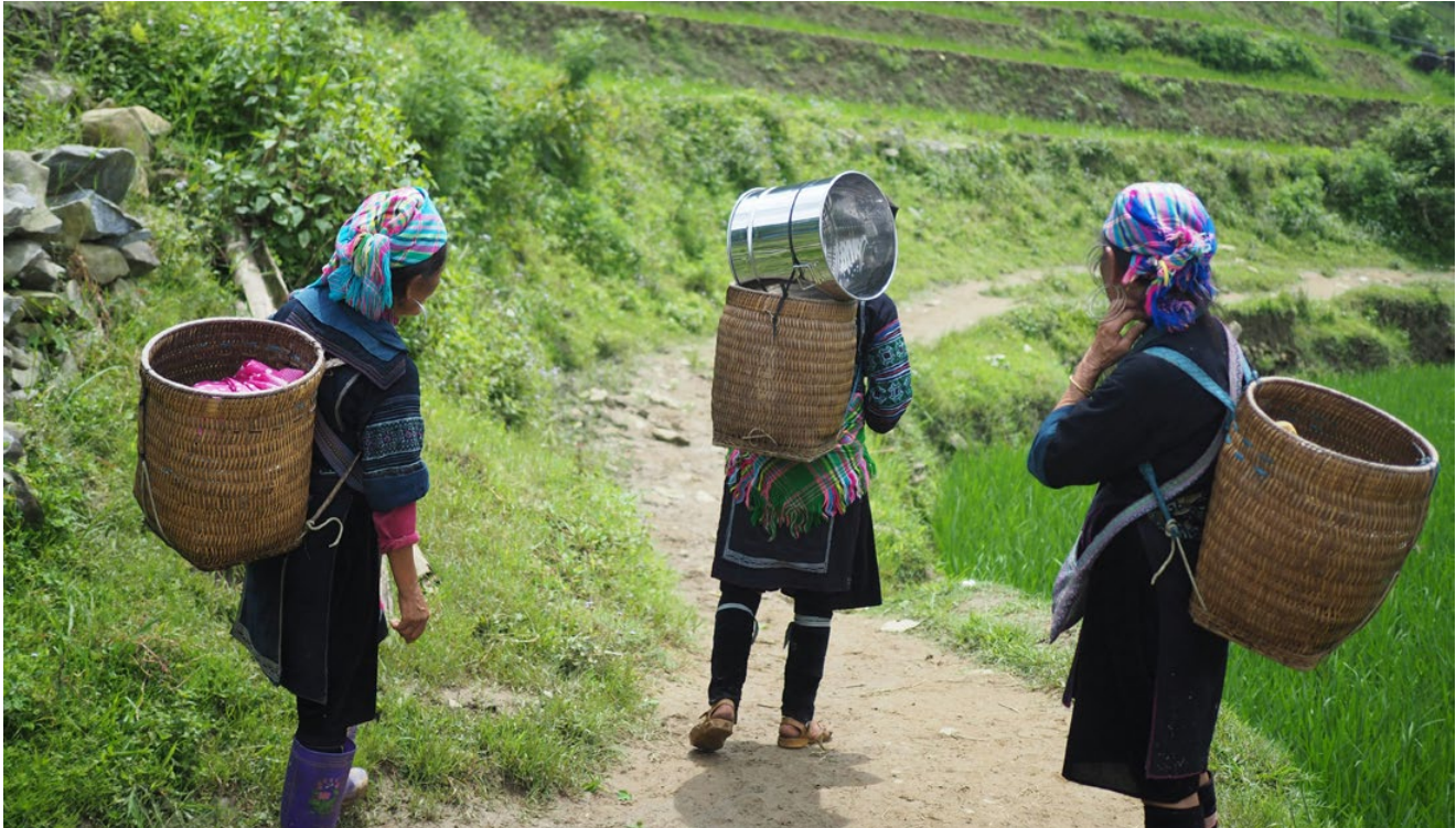
Women in Sa Pa Vietnam

3. Strengthening connections between urban PCAs and wider PCA networks to ensure ecological and social integration