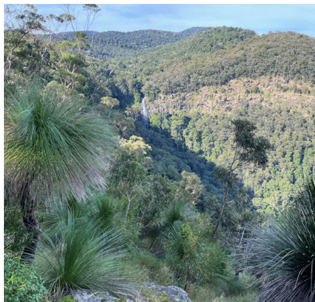
Lamington National Park, Queensland, Australia

Recognising the social nature of Target 3 means asking not only what areas to conserve, but also who will be affected, what impacts may arise, who makes decisions and how, and which values and knowledge systems are prioritised. This is essential for informing social safeguards, but also for identifying potential co-benefits such as for health, empowerment, security, employment, or inter-generational equity, and the pathways by which these might be achieved. Recognising such dimensions is key to engaging both conservation and development actors towards fairer, more effective implementation of Target 3.