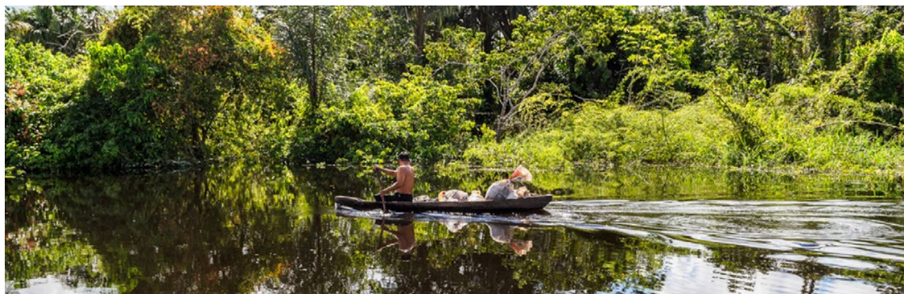
Food transport by canoe on the Mazan River, Loreto, Peru © Javier Fajardo.