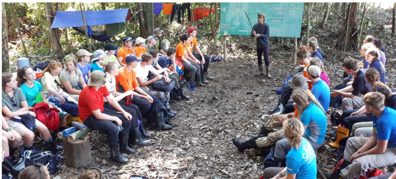
Conservation education camp organised by KOPEL, the local community cooperative at Pin Supu Forest Reserve, Sabah.

at which the application progresses causes them to lose momentum and interest. The prolonged timeline of the Green List process is particularly discouraging for local communities because they often lack the resources and capacity to sustain interest and motivation, in addition to the lack of opportunities to access funding compared to sites managed by government agencies.