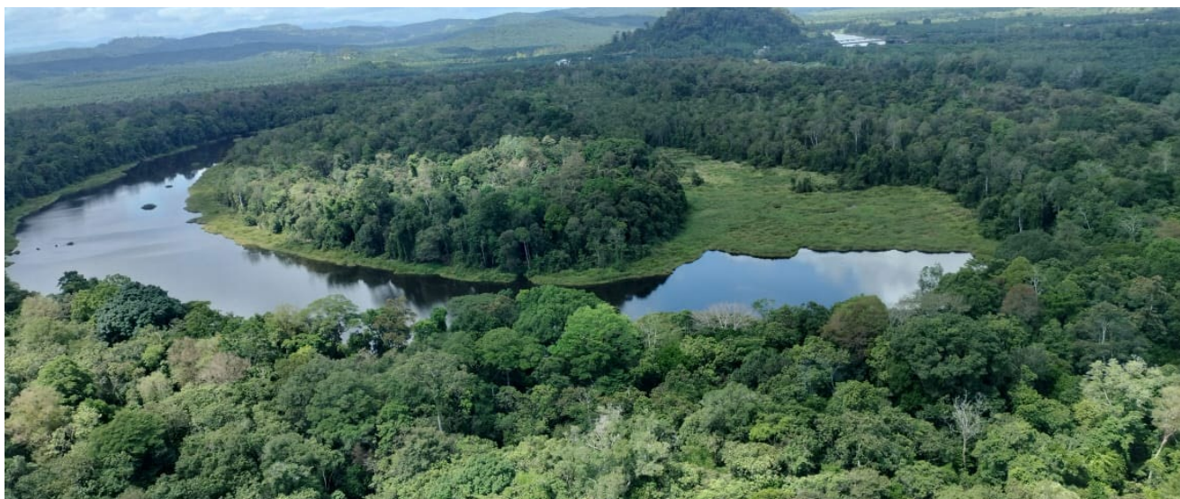
The oxbow lake at Pin Supu Forest Reserve, Sabah.

more inclined to invest in protected and conserved areas that demonstrate strong governance and sustainable management practices. Eppich and Grinda's (2019) study found that World Heritage recognition enhances a site's credibility, visibility, and access to international support and donor networks, even though these sites continue to rely heavily on government funding. While FSC and World Heritage Sites have different objectives to the Green List, they are used for comparison because all three share a common underlying mechanism, which is the international recognition that the site has met certain standards, thereby enhancing its credibility as a well-governed site.