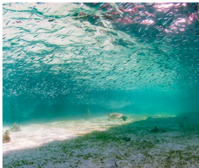
Seagrass habitat for Green Turtles. Underneath the jetty of Lankayan Island, SIMCA.

The findings above regarding the technical aspects of the 50 indicators do not suggest that the Green List standard should be made easier to achieve; rather, they point to key areas where many Malaysian protected and conserved areas must build capacity, improve data systems, and strengthen technical skills to meet global standards. The Green List process itself has acted as a catalyst for such improvements. For example, R3 reported that since beginning the process, their team has been collecting higher-quality data and conducting