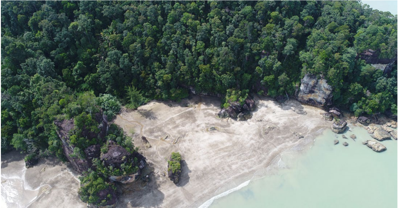
The picturesque Sapi Cape at Bako National Park, Sarawak.

Sarawak. The Bornean states are semi-autonomous and have control over their land and natural resources as compared to all states of Peninsular Malaysia. Respondents R1–R5 were directly responsible for Green List nominations and listing for their organisations. Respondent R6 is the Director for the protected area programme at the Department of Wildlife and National Parks, Peninsular Malaysia and oversees the effective management of all protected areas in the region.