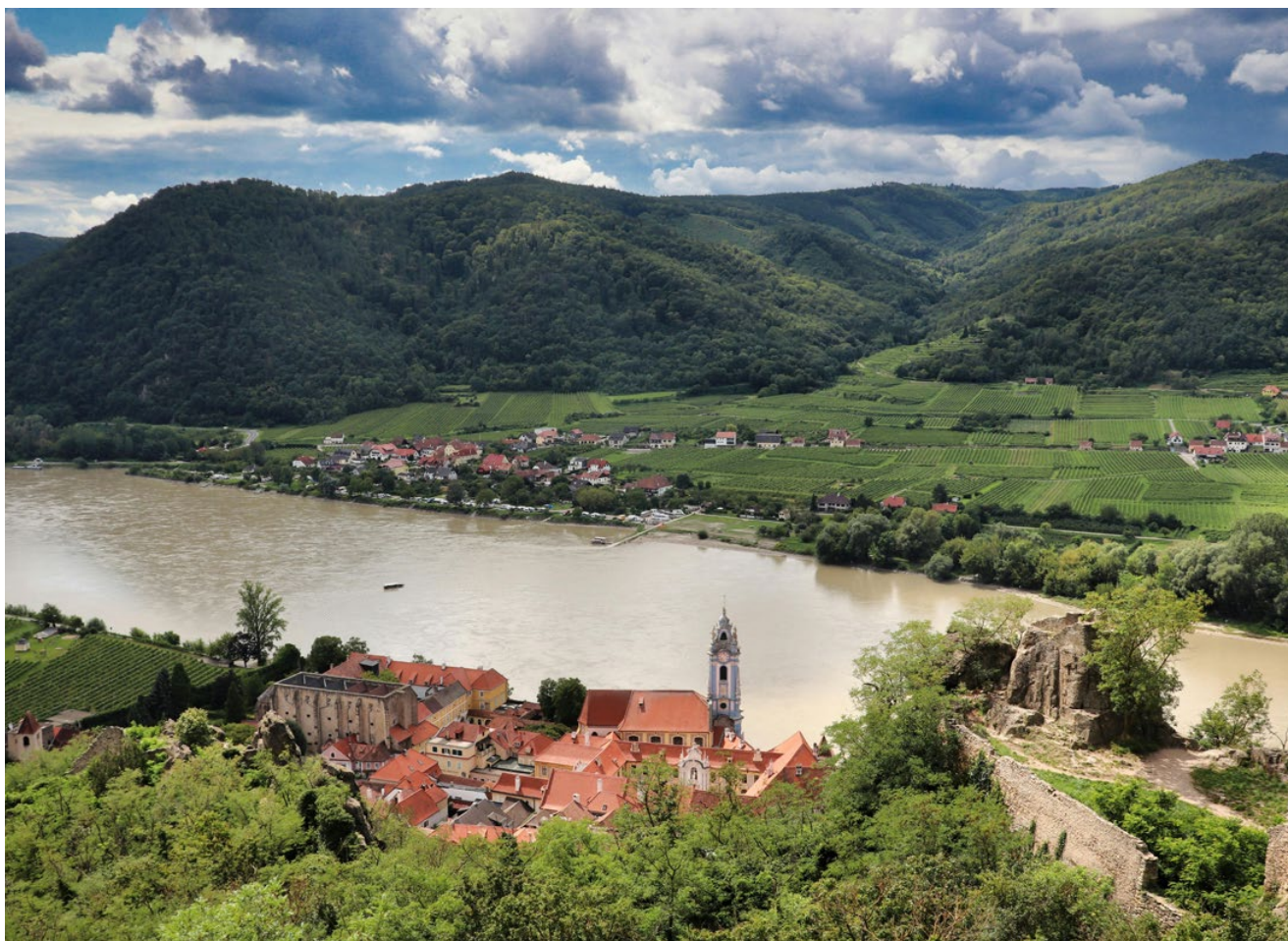
Wachau Cultural Landscape, Austria

the future but are not currently ‘relatively intact’ or in ‘good condition’, would allow for greater recognition of river sites. Care would need to be taken to ensure that appropriate undertakings for improving the integrity of the site were received, and that such discretion was only available for the inscription of sites, not the protection and management of WH generally.