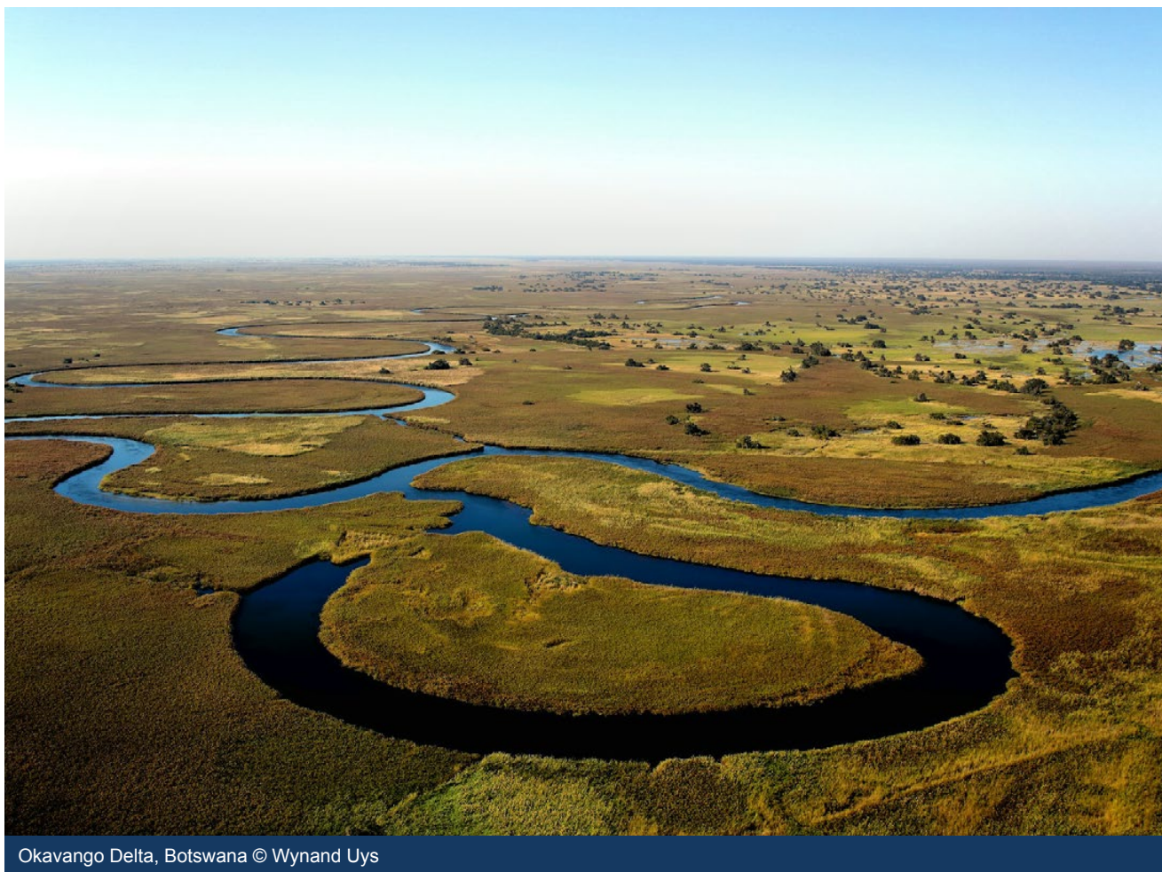
Okavango Delta, Botswana

of OUV. For each site, the Statement of OUV, which is the “key reference for the future effective protection and management of the property” (UNESCO, 2023a, ss. 51, 154–155), was text-searched for the words “river”, “stream”, “creek”, “río”, “basin”, “wetland”, “waterfall”, “watershed”, “watercourse”, “delta”, and “aquatic”. For properties which do not currently have a Statement of OUV (for example, Danube Delta), the same search terms were applied to (1) the site description available on the WH online database (UNESCO, 2023c), and (2) the relevant inscription decision. For each property that returned a positive result, the relevant site map on the WH online database (UNESCO, 2023c) (where available) was consulted to confirm that a river was included within the site boundary. Then, a determination was made whether the river contributed to OUV by assessing whether (1) the positive search terms related to a river and not a different body of water, such as a lake 1 ; and (2) there was a thematic connection between the river and the applicable OUV criteria and criteria narratives. Sites were excluded if a river was merely referenced to provide geographical context, such as defining a site boundary 2 .