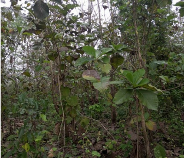
Teak Plantation in Osho Forest Reserve