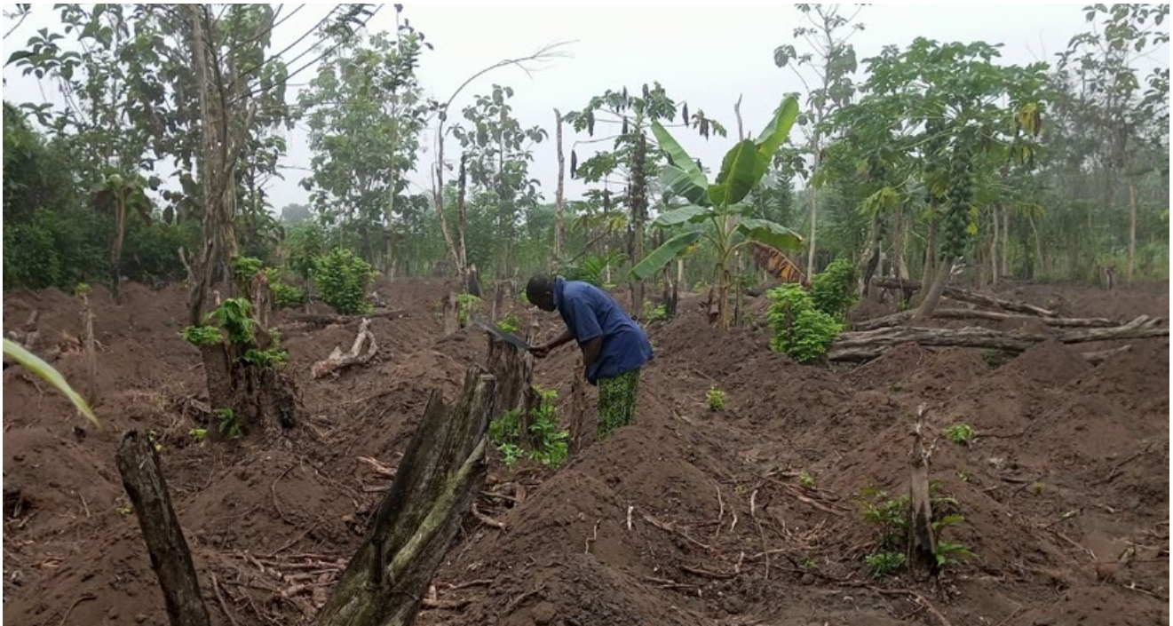
Farmland Cultivated for Yam in Osho Forest Reserve

Forest Reserve, as it was observed to increase in size by about 5.5 ha, annually. Bare land expansion has also been observed in forests of the Zurgurma Sector of Kainji Lake National Park (Adeyemi & Ibrahim, 2020) and Andoni LGA, Rivers State Nigeria (Eludoyin et al., 2019).