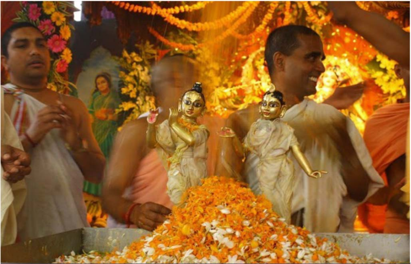
An idol of Khrishna and Radha being enspirited at a pran pratisha ceremony at Sri Sri Radha Madhava Mandir, Kanpur, UP, India. In India enspiriting is required before the idol can legally become a “juristic person”.