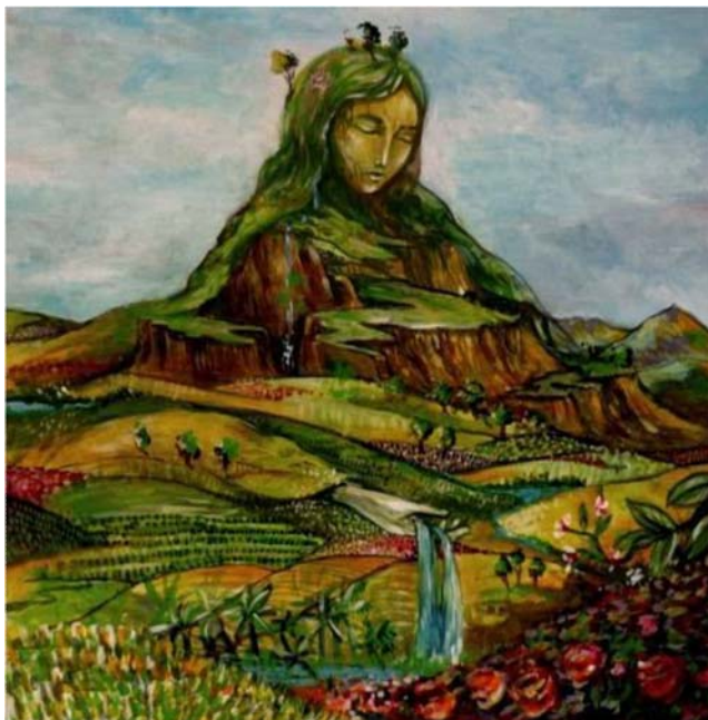
Bolivia enshrined natural world's rights with equal status for Pachamama in 2010.

Furthermore, the government appointed an ombudsman to defend or represent Mother Earth.