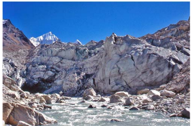
The Ganges River, India, and its 115 tributaries declared as multiple juristic persons in 2017 by the Uttarakhand High Court, Nanital, Kumaon Region, Uttarakhand State, India.

On the 2 May 2017, it was publically announced in the national newspaper of Columbia, El Tiempo that the constitutional court had declared the Atrato River Basin a ‘subject of rights’ meriting special constitutional protection (ABColumbia, 2017). The court called on the state to protect and revive the river and its tributaries and the Chocó. The state was given six months to eradicate illegal mining and to begin to decontaminate the river and reforest areas affected by illegal mining (some 44,000 ha). The court also ordered the national government to exercise legal guardianship and representation of the rights of the river (through an