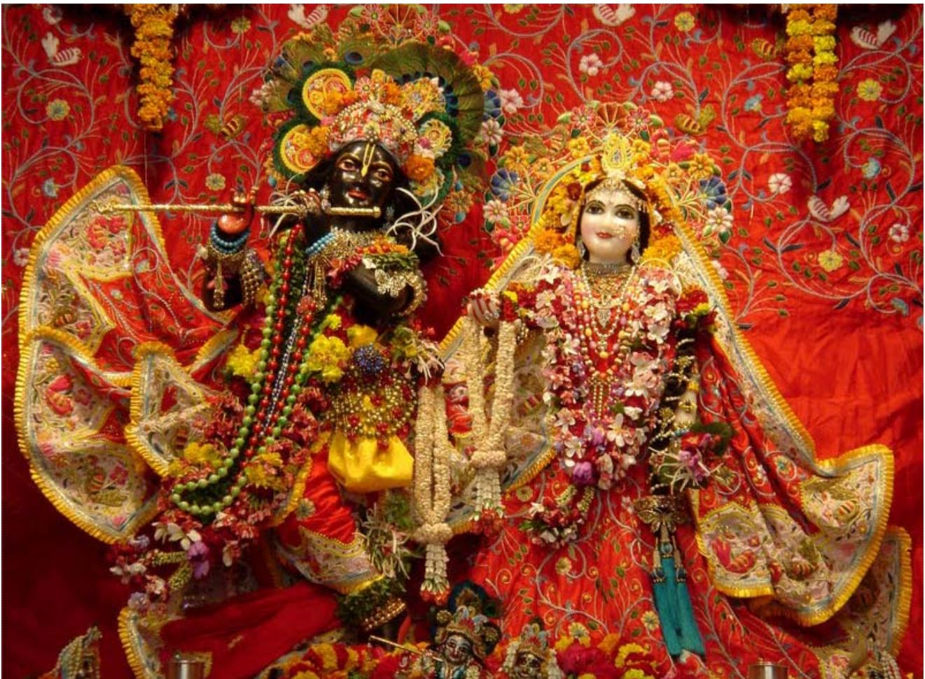
An enspirited idol of Radha Shyamsunderji (similar to the one above) was recognized as a "juristic person" in 1925 ( Mullick v Mullick ), Privy Council, Bombay High Court.

Various attempts have been made in modern times to accord legal status to OTHP. In 1925 colonial judges in India conferred juristic personhood on temples, idols and deities (e.g. Mullick v Mullick , 1925) contingent upon the enspiriting of an idol and Salmond's definition of 'person' (1913). Importantly, an idol (or a temple) does not develop into a juristic person until it is enspirited during a Pran Pratishtha ceremony