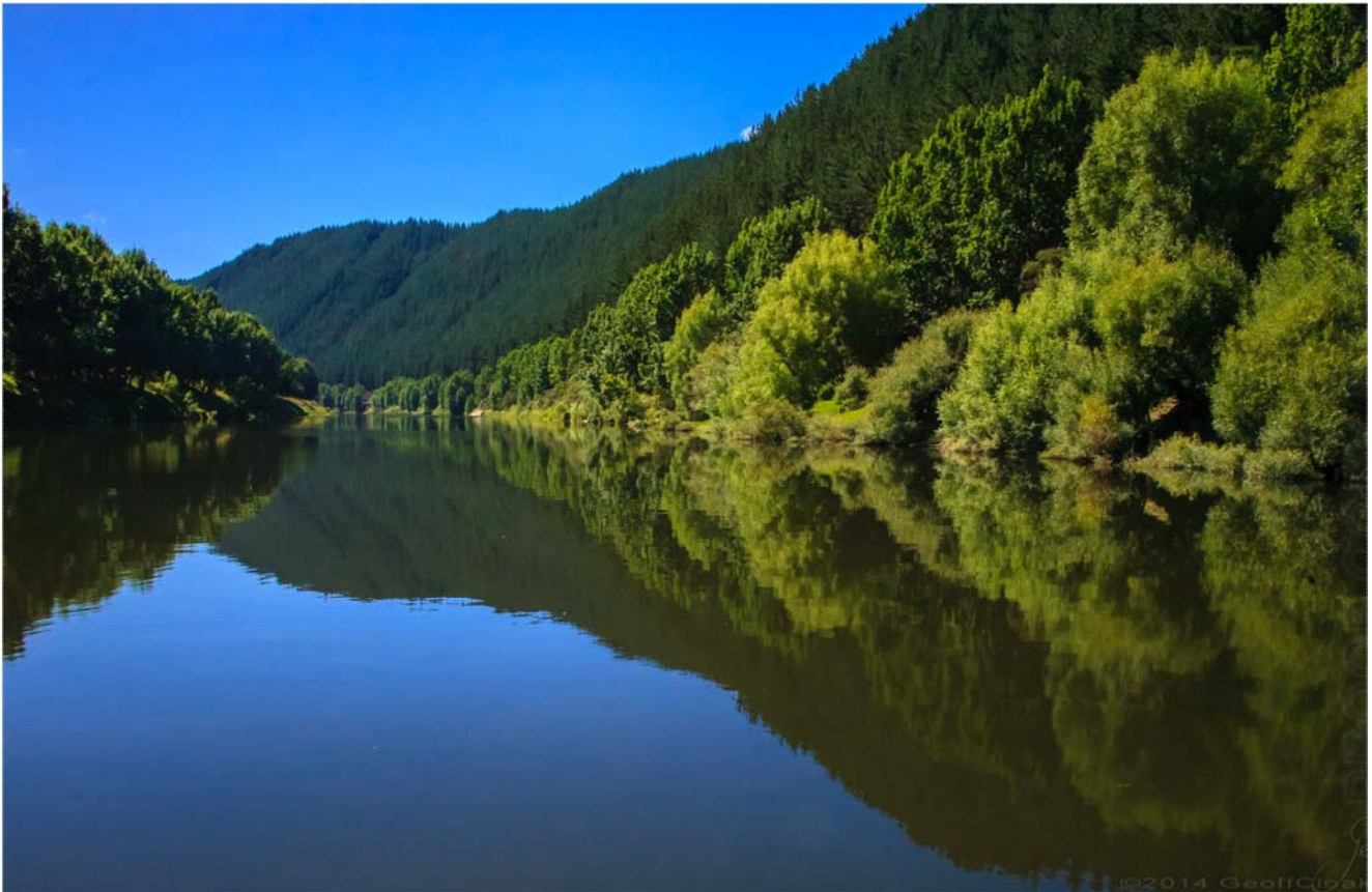
The Whanganui River, New Zealand – declared a juristic person in 2017

Parliamentary Counsel Office, 2016) at its third reading on 15 March 2017 (Scoop News, 2017), declaring that the Whanganui River was a legal person after 170 years of litigation by the Maori. The legislation established a new legal framework for the Whanganui River (or Te Awa Tupua ) whereby “Te Awa Tupua is a legal person and has all the rights, powers, duties and liabilities of a legal person” (The New Zealand Parliamentary Counsel Office, 2016, Clause 14 (1)) predicated on a set of overarching ‘intrinsic values’, or Tupuate Kawa . The legislation makes provision for two Te Pou Tupua or guardians appointed jointly from nominations made by iwi (Maori confederation of tribes) with interests in the Whanganui River and the Crown. Their role is to: “act and speak on behalf of the Te Awa Tupua ... and protect the health and wellbeing of the river” (Clause 19 a and b). The Te Pou Tupua is ‘supported’ by a Te Karewao , or advisory committee comprising representatives of Whanganui iwi , other iwi with interests in the River and local authorities. The Te Pou Tupua enter into relationships with relevant agencies, local government and the iwi and hapu (sub-tribe) of the river 3 .