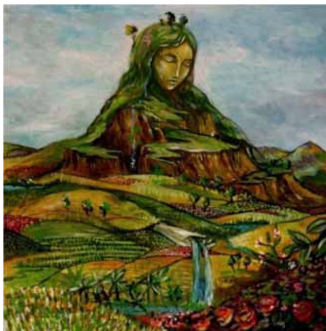
Bolivia enshrined natural world's rights with equal status for Pachamama in 2010.

Furthermore, the government appointed an ombudsman to defend or represent Mother Earth.