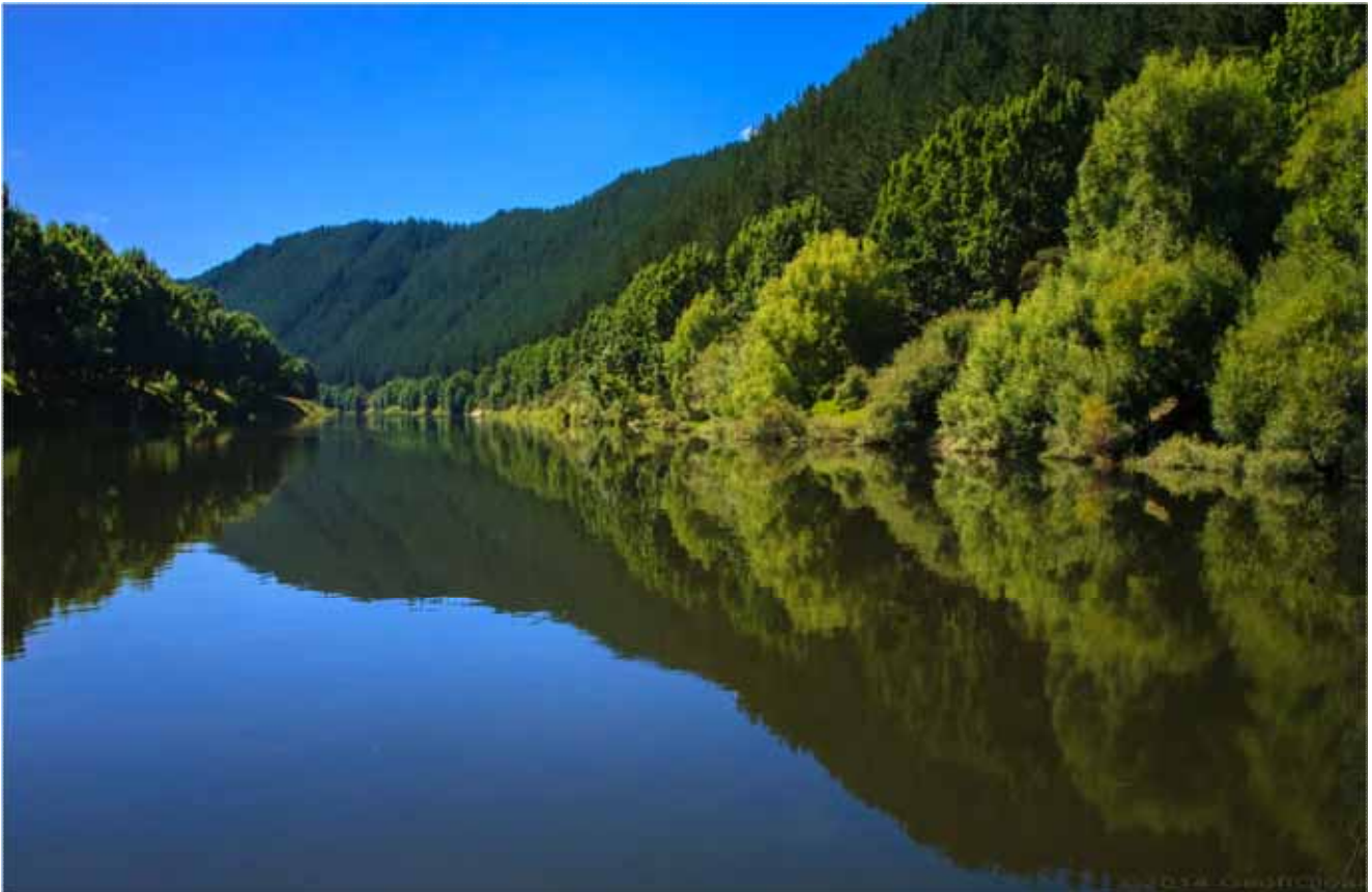
The Whanganui River, New Zealand – declared a juristic person in 2017

Parliamentary Counsel Office, 2016) at its third reading on 15 March 2017 (Scoop News, 2017), declaring that the Whanganui River was a legal person after 170 years of litigation by the Maori. The legislation established a new legal framework for the Whanganui River (or Te Awa Tupua ) whereby “Te Awa Tupua is a legal person and has all the rights, powers, duties and liabilities of a legal person” (The New Zealand Parliamentary Counsel Office, 2016, Clause 14 (1)) predicated on a set of overarching ‘intrinsic values’, or Tupuate Kawa . The legislation makes provision for two Te Pou Tupua or guardians appointed jointly from nominations made by iwi (Maori confederation of tribes) with interests in the Whanganui River and the Crown. Their role is to: “act and speak on behalf of the Te Awa Tupua ... and protect the health and wellbeing of the river” (Clause 19 a and b). The Te Pou Tupua is ‘supported’ by a Te Karewao , or advisory committee comprising representatives of Whanganui iwi , other iwi with interests in the River and local authorities. The Te Pou Tupua enter into relationships with relevant agencies, local government and the iwi and hapu (sub-tribe) of the river 3 .