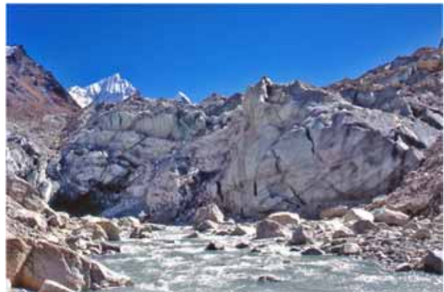
The Ganges River, India, and its 115 tributaries declared as multiple juristic persons in 2017 by the Uttarakhand High Court, Nanital, Kumaon Region, Uttarakhand State, India.

On the 2 May 2017, it was publically announced in the national newspaper of Columbia, El Tiempo that the constitutional court had declared the Atrato River Basin a ‘subject of rights’ meriting special constitutional protection (ABColumbia, 2017). The court called on the state to protect and revive the river and its tributaries and the Chocó. The state was given six months to eradicate illegal mining and to begin to decontaminate the river and reforest areas affected by illegal mining (some 44,000 ha). The court also ordered the national government to exercise legal guardianship and representation of the rights of the river (through an