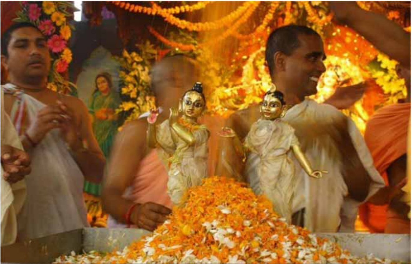
An idol of Khrishna and Radha being enspirited at a pran pratisha ceremony at Sri Sri Radha Madhava Mandir, Kanpur, UP, India. In India enspiriting is required before the idol can legally become a “juristic person”.