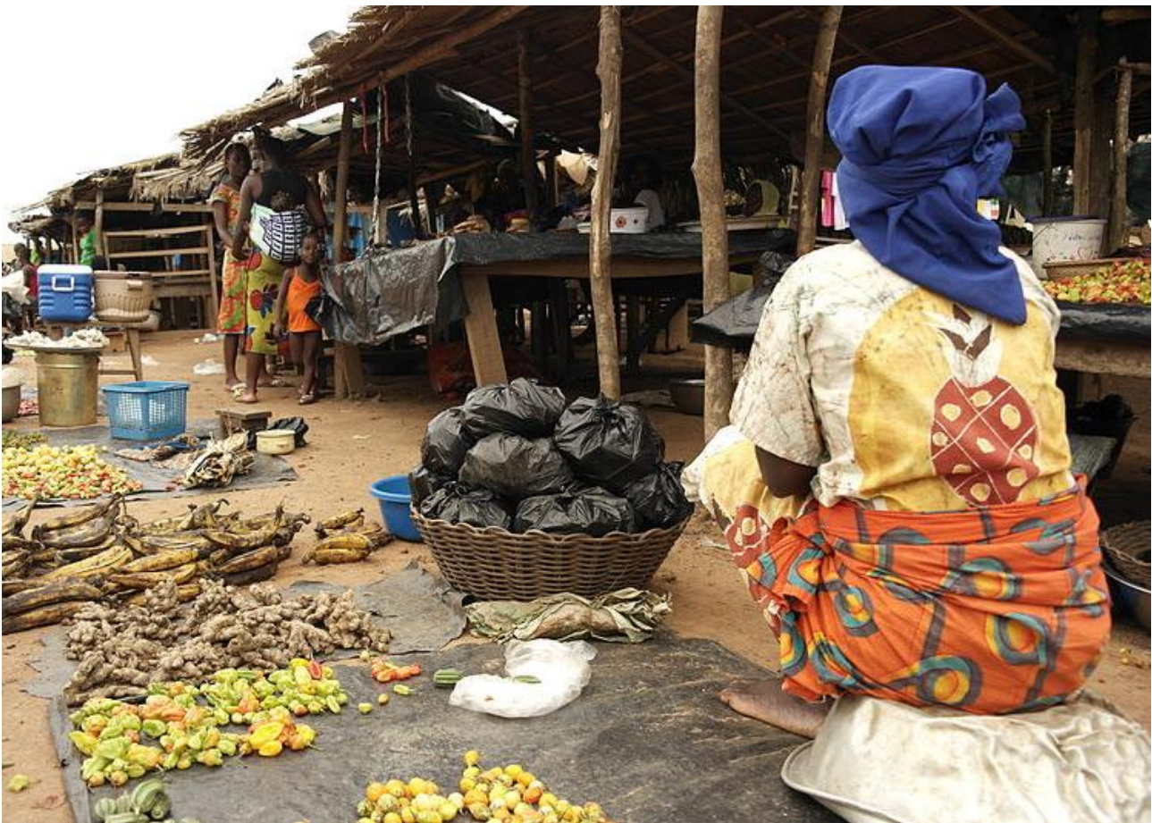
Adjacent communities in the market of the town of Tai, near the Tai National Park in Ivory Coast

only US$ 216 million for forestry offsets in 2012 (Peters-Stanley et al., 2013), while the number of REDD+ projects has been decreasing since 2010 (Simonet et al., 2015). Easements, water credits, and carbon are actually not large fungible market revenue streams and cannot be considered “plain vanilla opportunities” (NatureVest & EKO Asset Management Partners, 2014). With respect to financial markets, the 2008 crisis and current low interest rates similarly limit possibilities to generate significant returns, for instance for environmental trust funds.