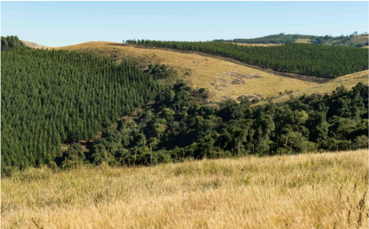
In South Africa, landowners sign management plans and are provided with incentives to conserve biodiversity on their private lands

signed in 2007, which was funded by both the European Union and the French Global Environment Facility (FFEM). Through the BSA, the seven chiefdoms have so far received US$ 122,500 annually, conditional to their strict compliance with the forest management plan. In 2012, the Gola rainforest was eventually gazetted as a National Park (GRNP).