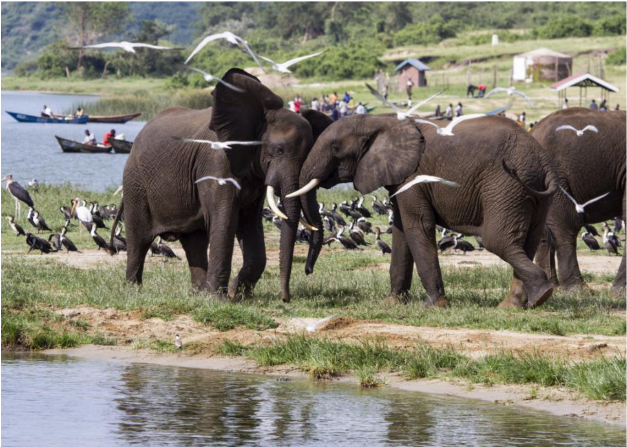
Elephants on the shore of Lake Edward, Queen Elizabeth National Park