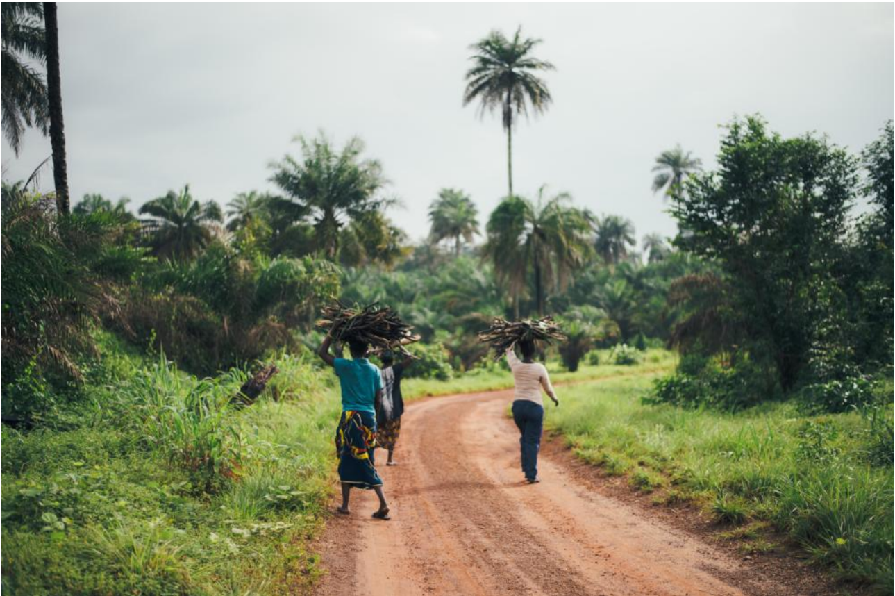
In Sierra Leone, benefit-sharing agreements are signed with forest edge communities to incentivize them and ensure enforcement of regulations

State in protected area management (Birner & Wittmer, 2004). Contractual arrangements should not, however, be ruled out because of their significant transaction costs. First, it remains to be seen whether contractual arrangements incur higher transaction costs than those that would be generated by more traditional arrangements. As demonstrated by Cumming et al. (2015) in South Africa, public costs may be significant. Second, transaction costs involved in designing innovative mechanisms are primarily supported during the instrument's starting phase. Hence, whereas this might be a significant burden in the beginning, this should dramatically decrease during the running phase, when results from the innovation (conditionality, incentives, monitoring) become tangible. In the mid- to long-term, such mechanisms may well be cost-effective.