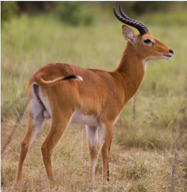
Kob antelope ( Kobus kob ) in Comoé National Park, Côte d'Ivoire. FPRCI conditionally funds OIPR to manage the protected area network in Côte d'Ivoire

Based on national priorities, NGOs and provincial conservation agencies reach out to landowners whose land is considered important for conservation. After a technical site assessment, a protection status is proposed for the site by the provincial conservation authorities and a specific management plan is drafted. The selected site must then be officially declared as a protected area as defined in the legislation by the official representative of the Province. A preliminary agreement between the Provincial authority and the landowner is submitted for official public consultation after which the agreement is gazetted and the management plan is officially approved by the Province. The surface area covered in the agreement is officially delineated, and the resulting maps, declaration and management agreement are sent to the governmental deeds office to be attached to the land parcels through a notarial contract. On this basis, landowners are then allowed to apply for a tax reduction in their annual tax declaration. The relevant provincial conservation authority is responsible for annual monitoring of the management plan implementation.