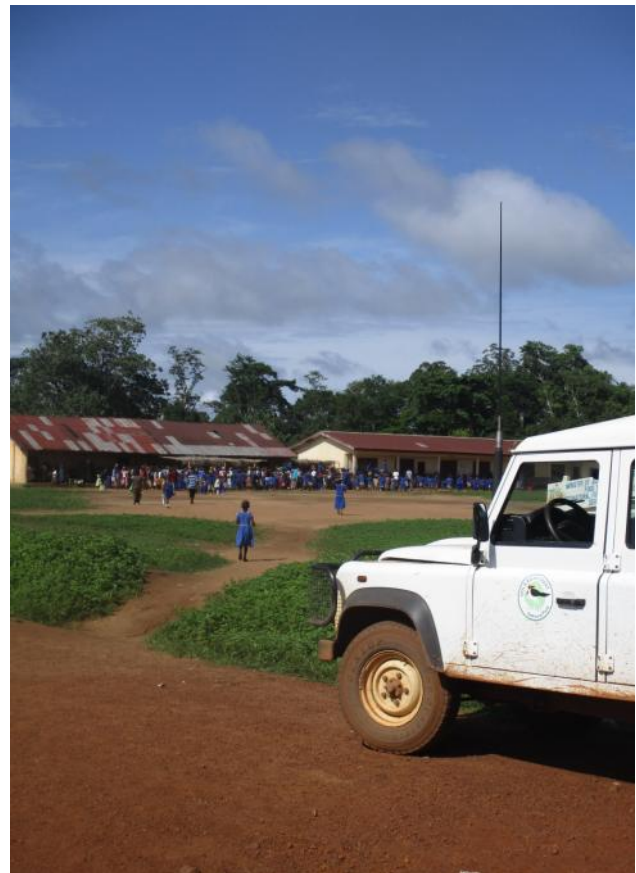
Funding the Gola Rainforest National Park through a non-profit company limited by guarantee (CLG) contributes to both conservation and development

Based on a review of experiences (Lapeyre & Laurans, 2016) this article presents three case studies from protected areas in Côte d'Ivoire, Sierra Leone and South Africa. Selected in close co-operation with IUCN, the sample is intended to encompass a variety of contractual approaches to explore the potential role of contracts in funding and managing protected areas in Africa. This article describes the contractual design of these protected area management models and presents the results with respect to biodiversity conservation efforts. It aims to highlight some of the key principles that should be considered before replicating such instruments. Finally, it addresses the challenges of such approaches.