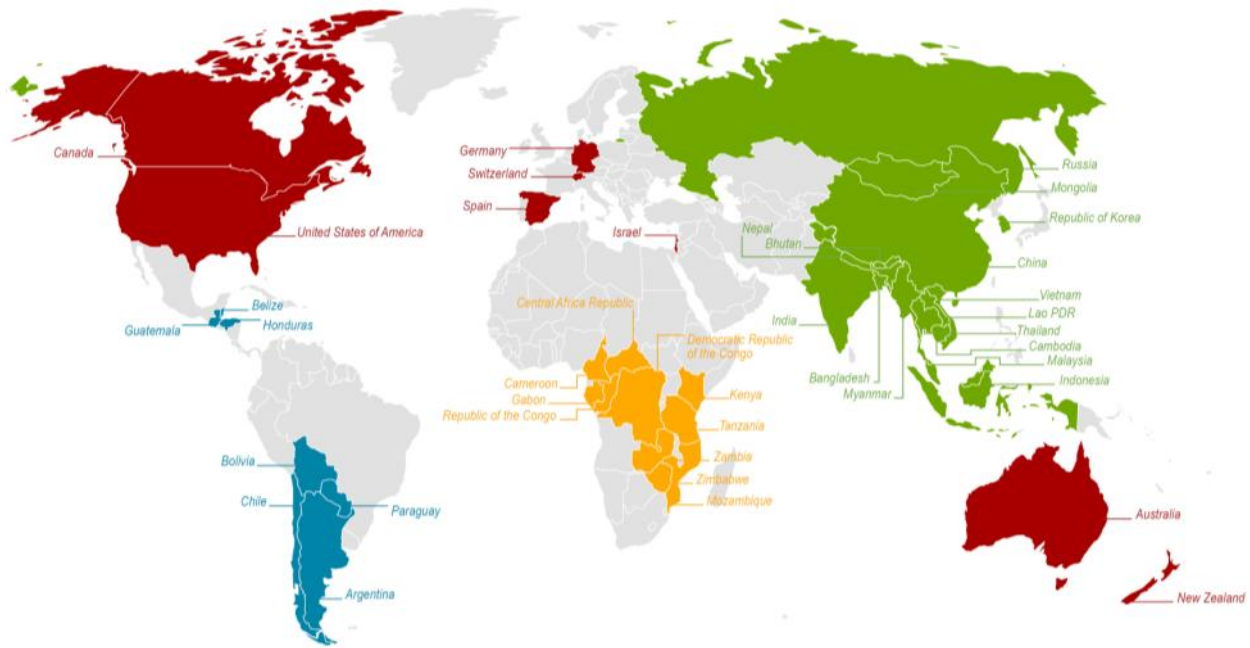
Figure 1: Map of countries from where data was sourced

other frontline field staff. It should be noted that this study focused only on rangers hired either on permanent or temporary contracts by governments. We fully acknowledge that other types of frontline protection staff, such as indigenous rangers, community game scouts, private landowners and private security, are widespread, numerous and deserve the same sort of analyses.