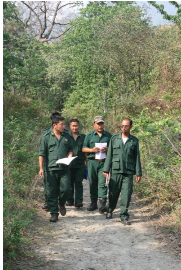
A ranger and soldiers collaborate to collect patrol data in Nepal (left) and rangers survey deep in a Bhutanese park (right)