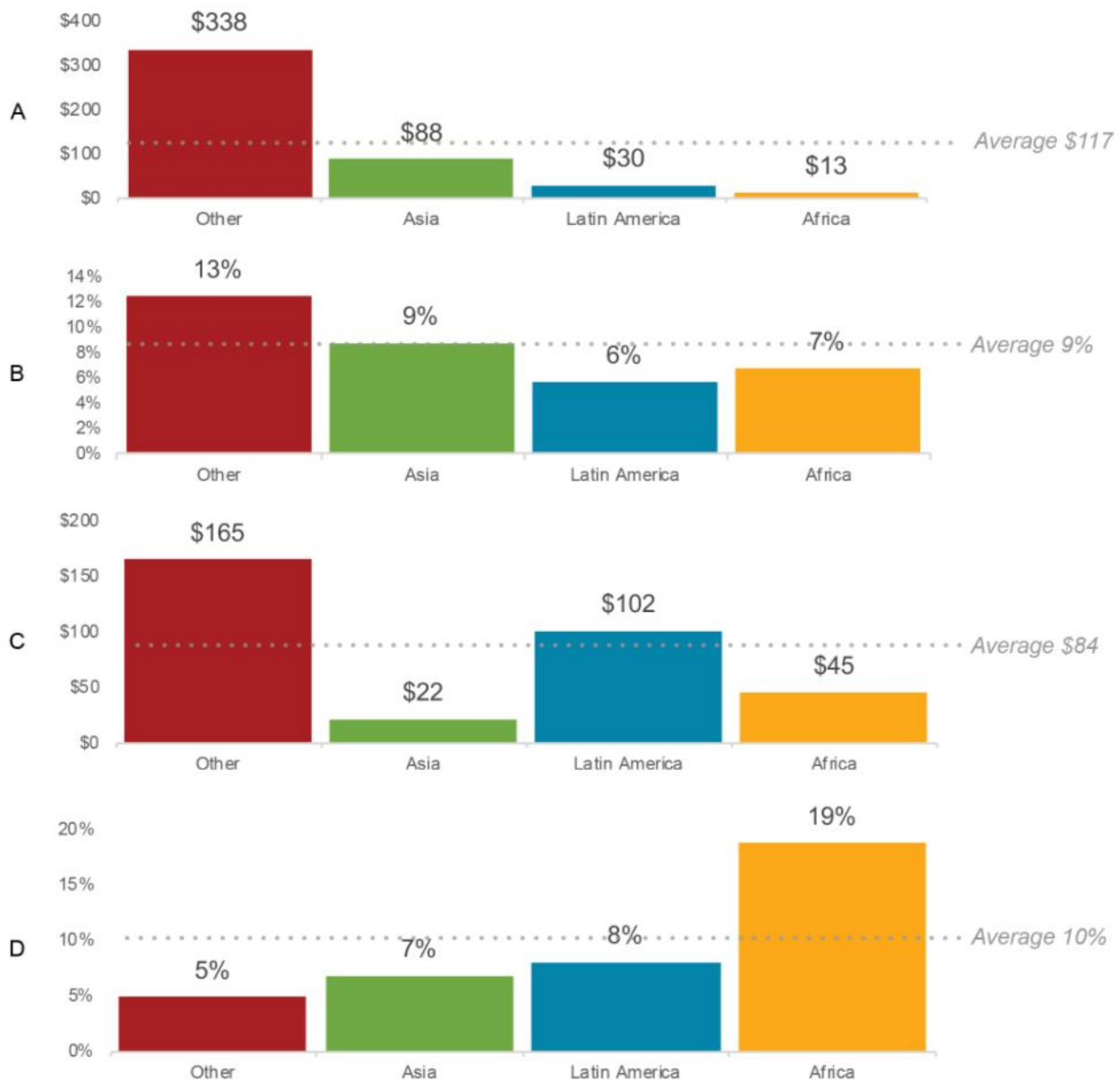
Figure 3: Average monthly premium paid for insurance in a) US Dollars, and b) as a percentage of monthly salary, and average deductible in c) US Dollars, and d) as a percentage of monthly salary