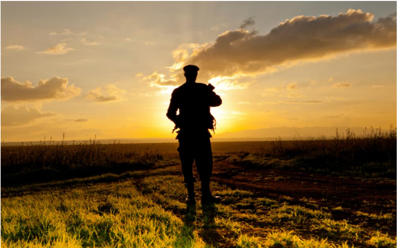
An armed ranger on patrol at sunset

maximize social impact. He has a master's degree in Social Enterprise from the School of International Service at American University.