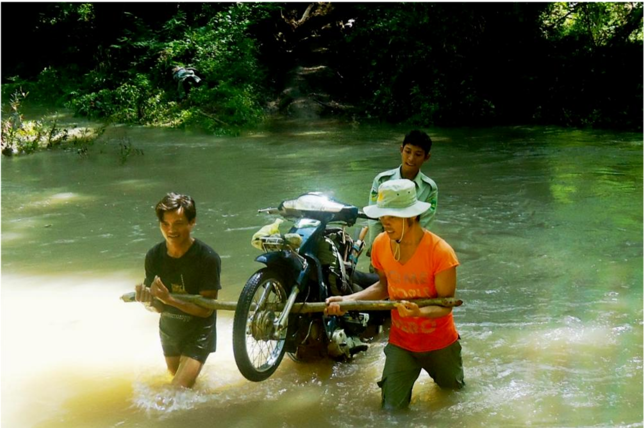
Rangers carry a motorbike across a flooded river in Cambodia

morale and wellbeing of rangers in Uganda. In one example from Nigeria, 100 per cent of respondents expressed lack of adequate healthcare support, and this, along with other stressors, meant that 87.5 per cent of rangers interviewed were very dissatisfied with their job (Ogunjinmi et al., 2008). Even simple-to-address issues such as access to equipment and training can have an impact on the profession. Across Asia, 74 per cent of rangers perceived they lacked access to proper equipment, and 48 per cent felt they were inadequately trained. It should be no surprise therefore that 48 per cent of rangers stated they would not want their children to become a ranger (WWF & RFA, 2016). Similarly, in Africa, 59 per cent of rangers perceived they lacked access to proper equipment, and 42 per cent felt they were inadequately trained, with 54 per cent of rangers not wanting their children to become a ranger (WWF, 2016).