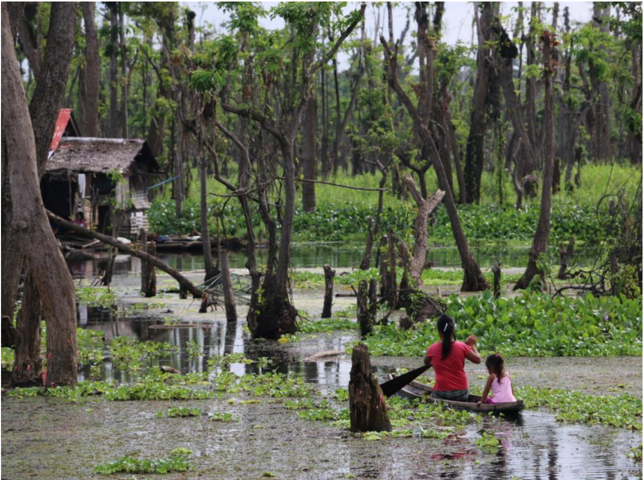
Agusan Marsh Wildlife Sanctuary, Philippines

opportunities, as is the case, for example, in the UNDP framework of governance principles (Graham et al., 2003). However, for the context of protected areas, IUCN and its partners have adapted and expanded the scope of these principles to include: legitimacy & voice, direction, performance, accountability, and fairness & rights (Borrini-Feyerabend et al., 2013). Although a wide range of governance assessment tools exists, none has yet been applied as widely in the protected area context as the management effectiveness tools. A relatively new addition to the toolkit is the Whakatane Mechanism, which has a particularly strong focus on situations of rights violations (Freudenthal et al., 2012).