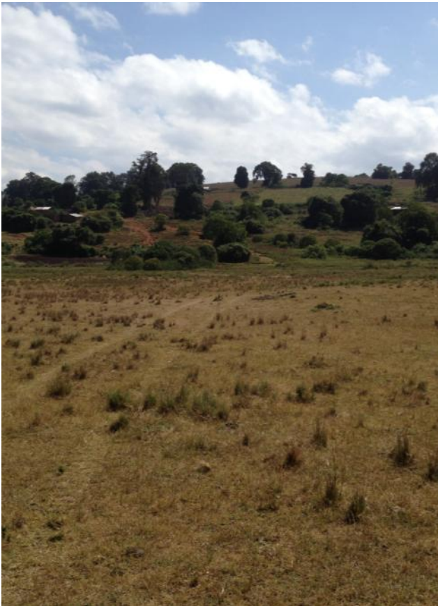
Encroachment in Loita Community Forest, Kenya

in – to start with certain key elements, such as participation in decision-making, provisions for resource access, and other benefit-sharing arrangements.