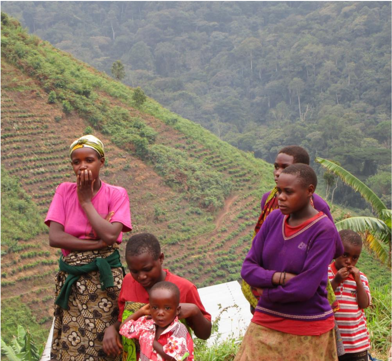
Discussions on the edge of Bwindi Impenetrable National Park, Uganda

existing legislation to gazette the area as a forest reserve, protect it for the community, have it adjudicated into individual parcels, and establish group ranches – all in the face of strong opposition from other groups.