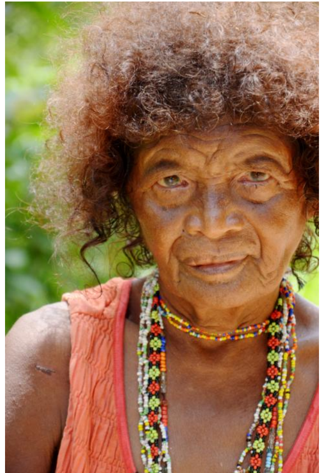
A Mamanwa woman takes a break from harvesting grass blades for mat-weaving

6 The ICCAs currently in the WDPA were identified using the WDPA's governance type field: "Indigenous peoples" or "Local communities". Most were included in the WDPA prior to, or during early stages, of the Registry's development.