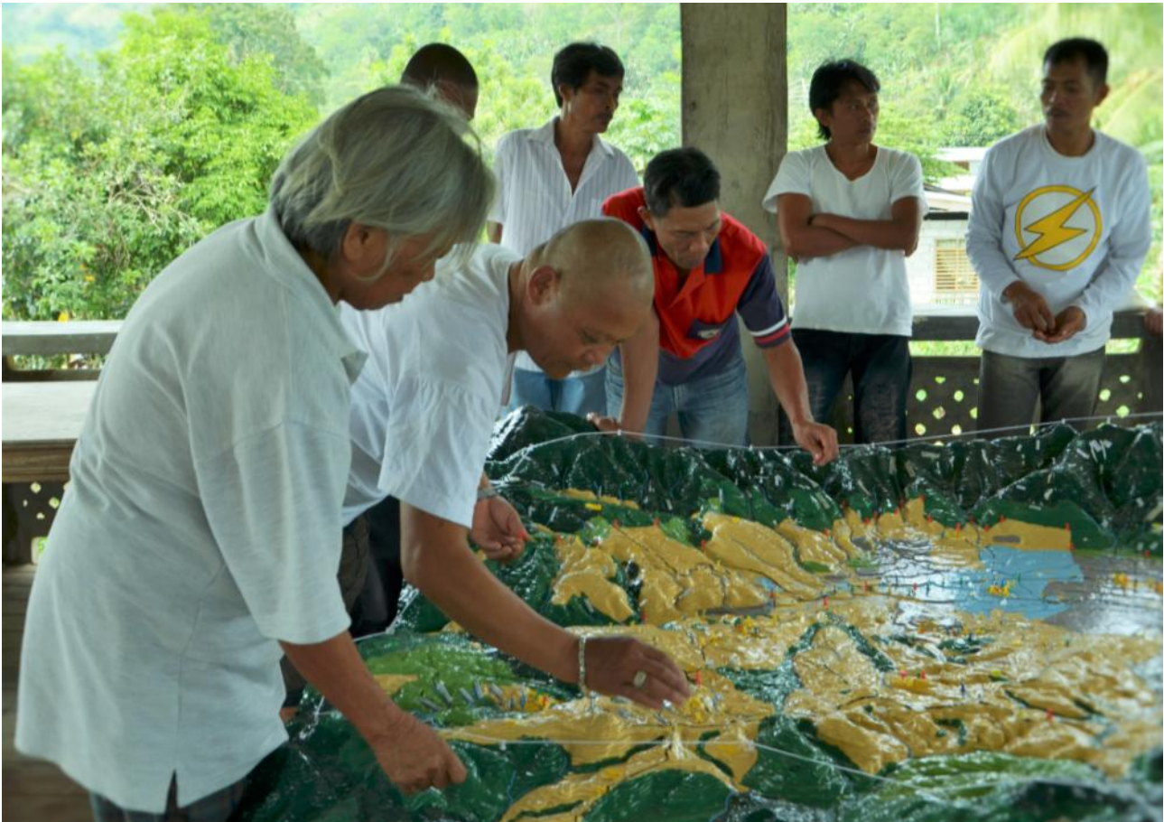
Young and old Mansaka converge at the blank 3-dimensional map of their ancestral domain to translate crude sketches into understandable land use information that will be used for purposes including conservation planning

The Global ICCA Registry (referred to as the “Registry”) is an online information platform 1 , which allows for registration of ICCA sites. It was created to help document, recognize and protect the vital contributions that indigenous peoples and local communities have made to conservation in the past and present. The Registry consists of a secure, offline database containing core descriptive data of ICCAs collected via a questionnaire; the data and platform used follow the same standards as the World Database on Protected Areas 2 . The Registry website also features a number of in-depth case studies that provide comprehensive details about a site’s history, development and bio-cultural features. The Registry facilitates the documentation of ICCAs regardless of whether the site is formally recognized as a protected area or meets the IUCN definition (see Dudley, 2008). Because the Registry adopts a peer-review and quality control process in line with other global conservation databases, it offers an unprecedented opportunity to consolidate knowledge on ICCAs.