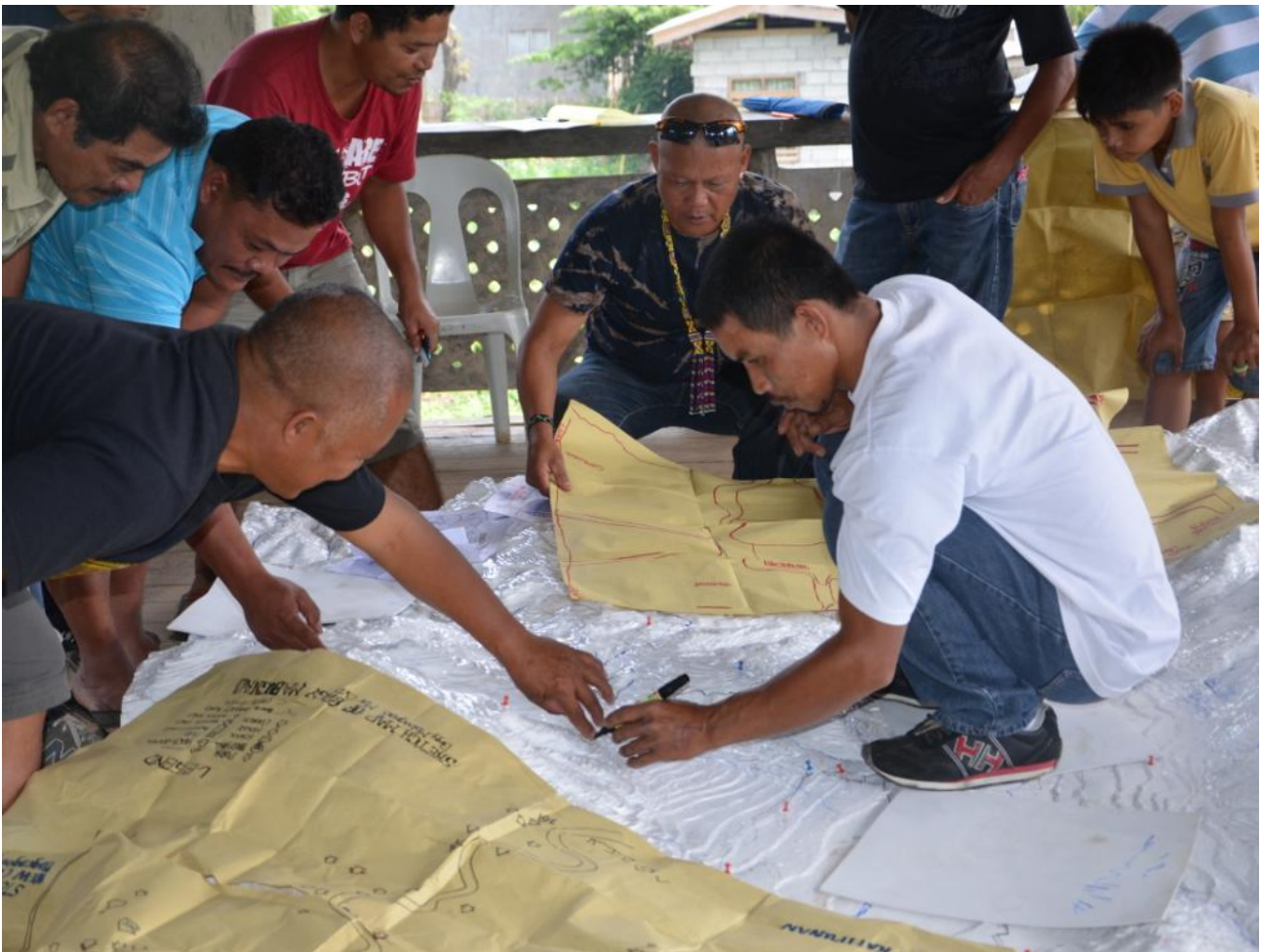
Mamanwa-Manobo elders delineate the boundaries of their ICCA on the 3-dimensional map using strings and nails

2010). The partnership governing the Registry worked together through in-person and other mechanisms over the course of several months to identify critical questions that the Registry could address (Table 1). The Registry's design was informed by the robust platform of the WDPA so it comprises spatial data (i.e. boundaries and points) with associated attribute (or descriptive) data. While it was important that the Registry adhere to the same quality and data standards as the WDPA, it was designed to contain additional, in-depth information, in particular on ICCA governance and community characteristics. Thus, the Registry includes the same core data fields as the WDPA, with up to 30 optional data fields that help answer these questions.