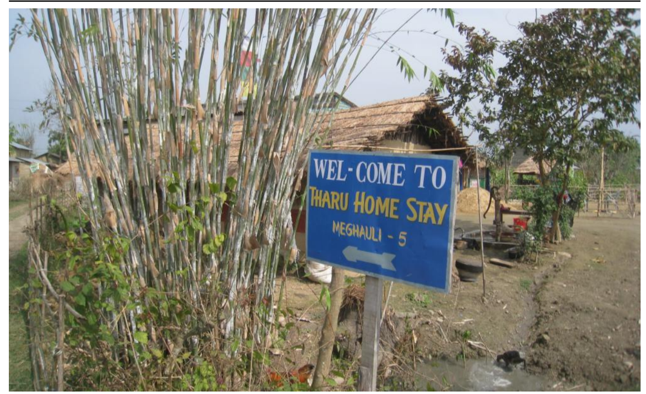
Homestay in buffer zone of Chitwan National Park © Teri Allendorf.

agriculture and alternative energy are in the conservation category while wildlife damage mitigation is listed in development.