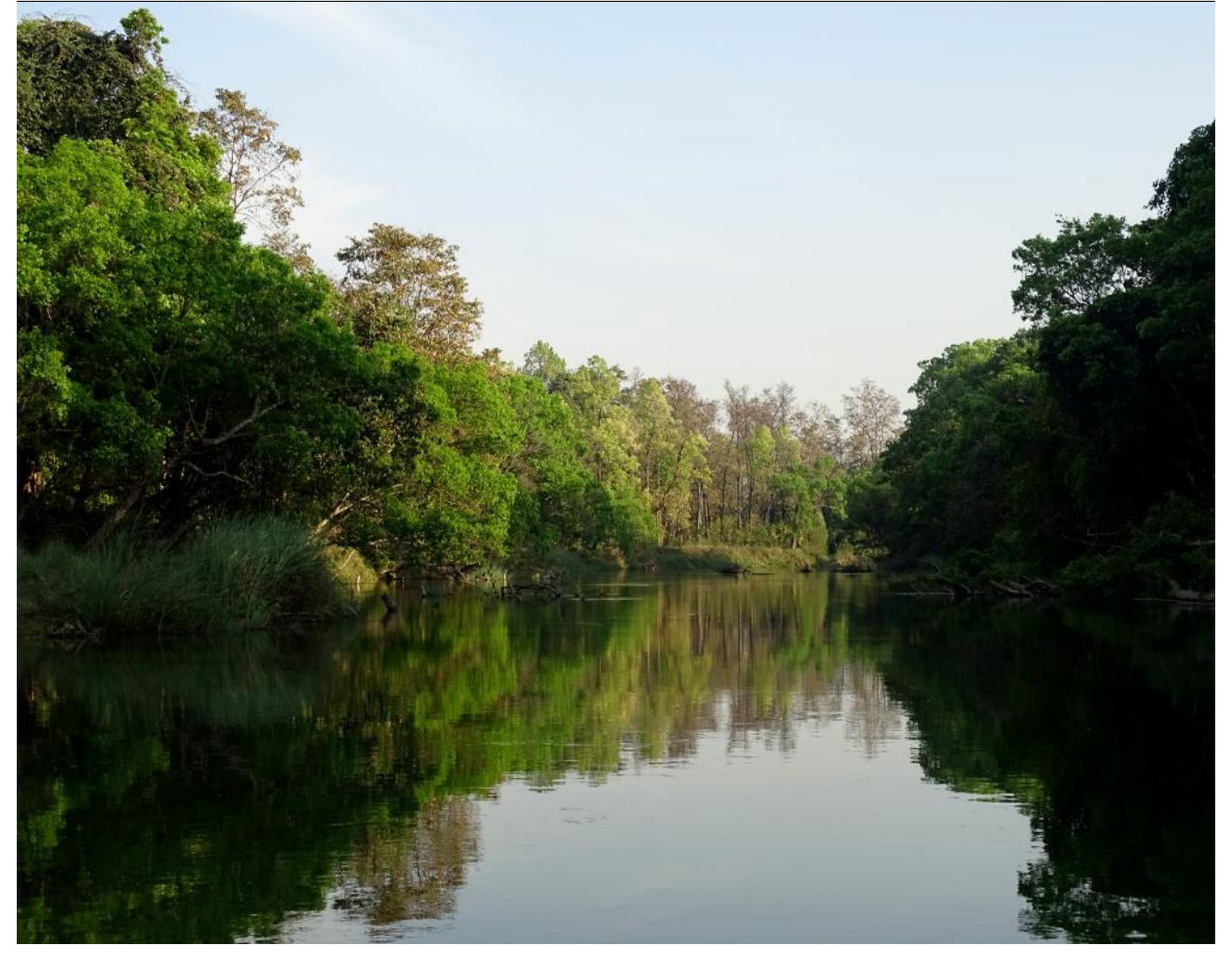
Bardia National Park

development as polarized goals. They have avoided the difficult, if not impossible, task of categorizing activities into discrete categories that reflect some set of perceived conceptual relationships between conservation and development (Kepe et al., 2004; Walpole & Wilder, 2008). These relationships are often conceptualized as categories that reflect some permutation of conservation as helping or hindering development and development as helping or hindering conservation (Salafsky, 2011; Adams et al., 2004). At the national level, the inconsistency of categories and activities in the regulations and guidelines reflects, at least to some extent, the difficulty of clearly differentiating distinct categories. At the protected area level, the inconsistency of activities within the different categories is also probably an indication of the difficulty in practice of defining activities in terms of conservation versus development.