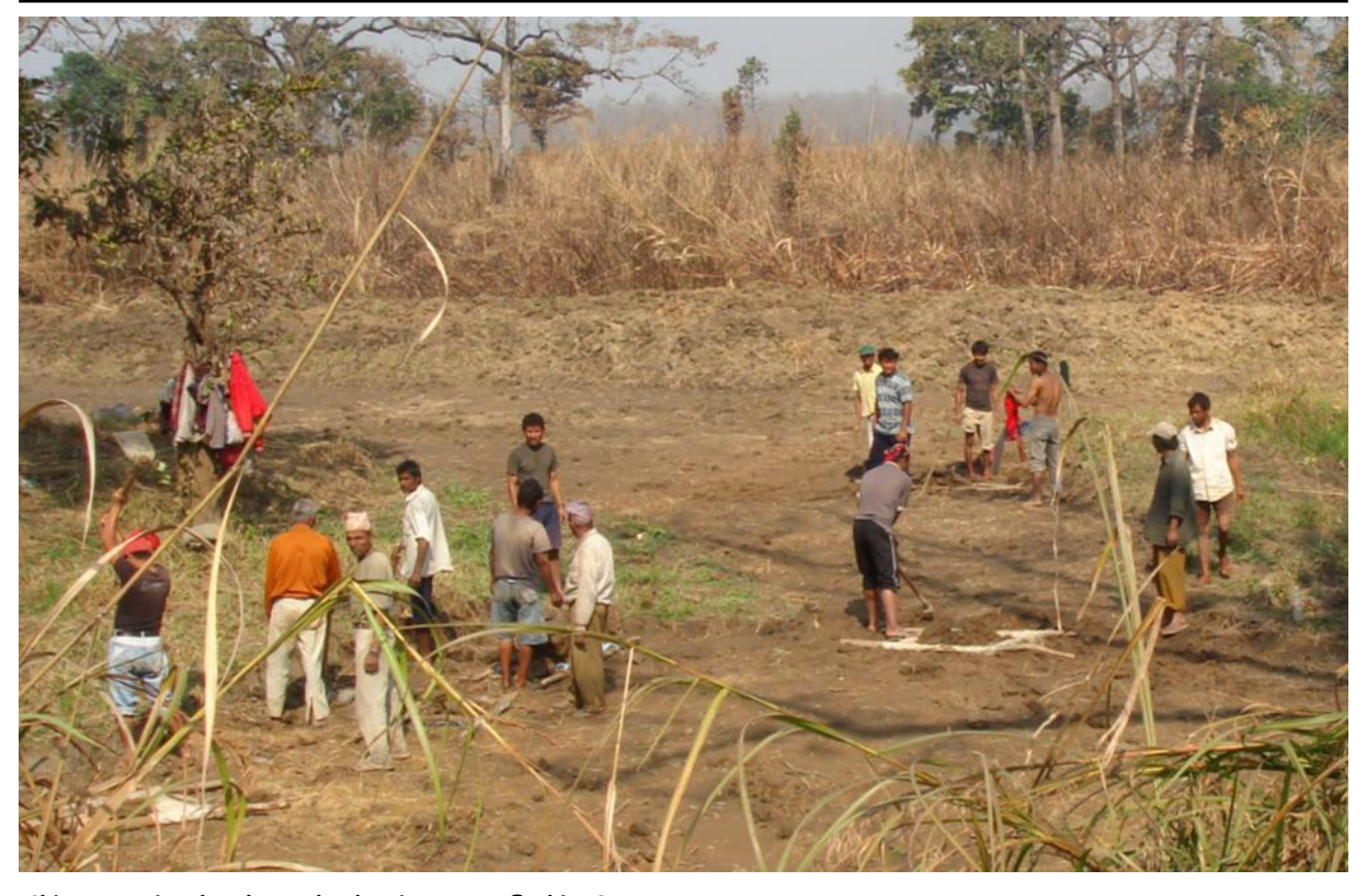
Chitwan National Park grassland maintenance

the second question, to determine if the budgets follow the policy guidelines for buffer zone projects, the budgets in the plans are compared to the provisions in the legislation. For Rara NP and Shey Phoksundo NP, the budget summaries provided in the management plans for each activity category are used. For Bardia NP and Chitwan NP, the management plans did not provide summaries by budget categories, so we estimated total budgets for each activity category by compiling activity lists from the detailed budgets for each buffer zone. To answer the third question, we describe the activities in each management plan.