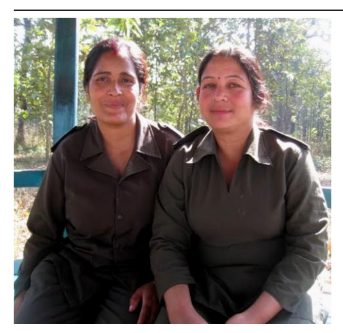
Community forest guards near Chitwan National Park © Teri Allendorf.

similar activity titles, which made it possible to sum the amount spent on specific activities across all of the committees to find total amounts allocated to each type of activity.