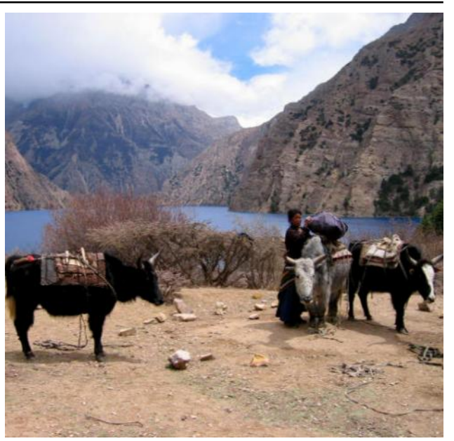
Shey Phoksundo National Park

It was not possible to summarize activities for Bardia NP and Chitwan NP because the management plans did not include activity descriptions that were similar enough across the user committees to understand what the activity entailed. A more detailed understanding of each activity would be needed in order to summarize into broader categories of activities.