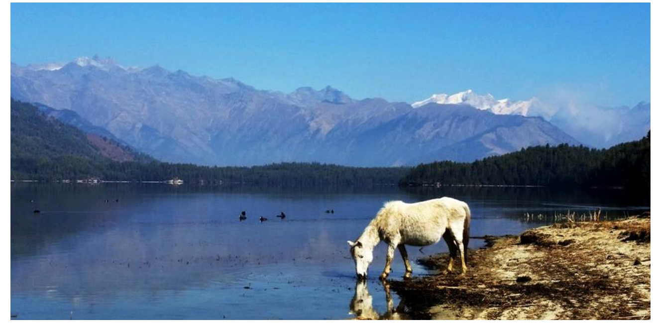
Rara Lake

better prioritization and support of certain activities, especially those that directly mitigate conflicts with wildlife. For example, in Chitwan NP, people felt mitigation of these problems was one of the most urgent community needs (Spiteri & Nepal, 2008). People wonder why, for example, the construction and maintenance of electric fences and other mitigation measures are not prioritized. While the construction of electric and non-electric fences has been funded over the past few decades, through both buffer zone funds and NGO projects, construction has been piecemeal with no plan for funding of renovation or maintenance.