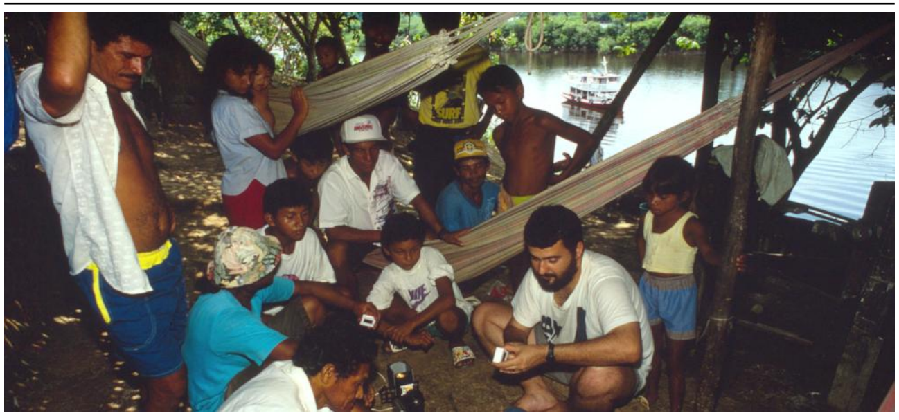
Researcher showing slides to Seringalzinho inhabitants, Jaú National Park, Brazil