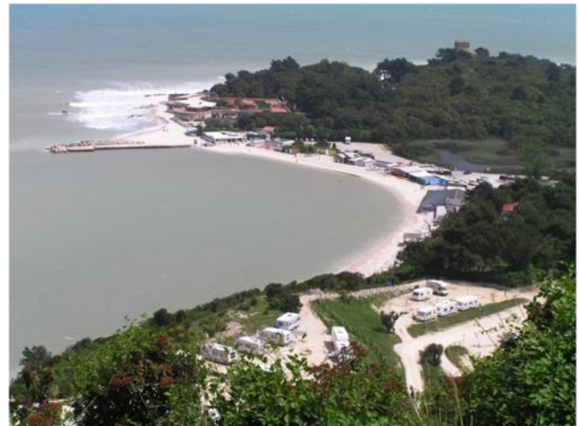
Picture 8: Parco Naturale Regionale del Conero, Baia di Portonovo. The buildings, mainly tourist restaurants, on the beach © Emma Salizzoni (May 2010)

Managers of Parco del Conero are currently seeking to limit land consumption in the beach area of Portonovo (Picture 8). The parks plan guides the provision of incentives to owners of the buildings along the beach, mainly tourist restaurants, who decide to move their structure back from the coastline. This initiative has yet to be tested for effectiveness, but it is nevertheless interesting. Park management abandons a purely regulatory point of view in order to promote self-managed local development by stimulating the private sector to act according to the general aims set by the plan. They are experimenting with a complex balance between environmental conservation and socio-economic development.