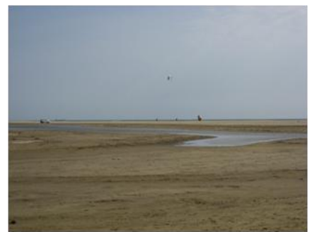
Pictures 9-11. Parc Naturel Régional de la Narbonnaise en Méditerranée, île des Coussoules. On the left, the parking localisation (Source: Parc Naturel Régional de la Narbonnaise en Méditerranée, 2005); in the centre, the parking; on the right, the beach nearly devoid of cars © Emma Salizzoni (May 2010)