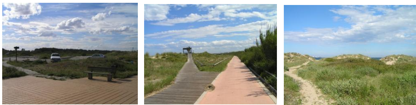
Pictures 12-14: Parque Natural de la Albufera de Valencia, Devesa, El Saler. On the left, the parking lots; in the centre the pedestrian path that runs parallel to the litoral; on the right, the footpaths leading to the beach © Emma Salizzoni (May 2010)

can be found at the beach of Île des Coussoules in Parc de la Narbonnaise . The beach used to be covered with cars and camper vans, until, a parking area connected to the beach by pedestrian paths was built away from it (Pictures 9-11). Thanks to this simple and effective solution the beach is now completely free of vehicles.