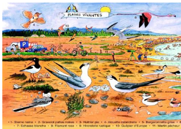
Picture 15: Parc Naturel Régional de la Narbonnaise en Méditerranée. A representative image of the 'Plage Vivantes' project. An alternative tourist use of the beaches is promoted, in order to preserve biodiversity values (bird life)

Three S's tourism may be of concern for inland areas. The key strategy behind the actions of park management is to redistribute visitor flows from the coast to inland areas and