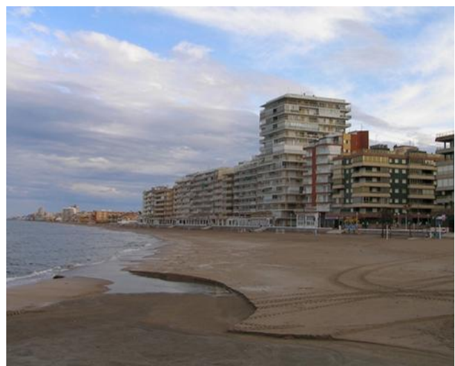
Picture 1: Parque Natural de la Albufera de Valencia. Coastal urbanisation inside the park, between El Perello and Mareny Blau: A scenic and ecological barrier between the sea and the rural inland areas © Emma Salizzoni (May 2010)

The policies developed within the three protected coastal areas, Parque Natural de la Albufera de Valencia, Spain (1986), Parc Naturel Régional de la Narbonnaise en Méditerranée, France, (2003) and Parco Naturale Regionale del Conero, Italy (1987), are useful references for pursuing Aichi Biodiversity Target no. 5. These protected areas are comprised of territories which have been consolidated destinations for seaside tourism since the 1970s and thus, they share concerns arising from mass tourism. The parks have to reconcile tourism development, which constitutes the main driving force behind the local economies, with biodiversity conservation (Dudley, 2008). As category V, IUCN, 'Protected Landscapes-Seascapes,' the parks are appropriate places for experimenting with sustainable tourism strategies, because their mission specifically promotes a harmonious interaction between people and nature.