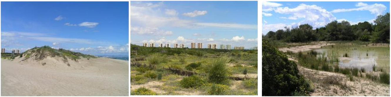
Pictures 5-7: Parque Natural de la Albufera de Valencia. The results of the work in Devesa (La Malladeta): on the left, the first dune front; in the centre the inner dunes (the buildings planned by the Plan General de Ordenación del Monte de la Dehesa, 1963, are visible); on the right, a restored mallada © Emma Salizzoni (May 2010)

Increases in biodiversity as a result of the project are already noticeable. The restored lagoons are now acting as important habitats for bird-life, while reintroduced autochthonous plant species are once again growing on the dunes (Pictures 5-7).