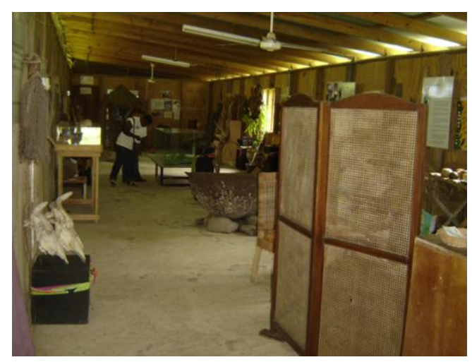
Charles Town Maron Museum