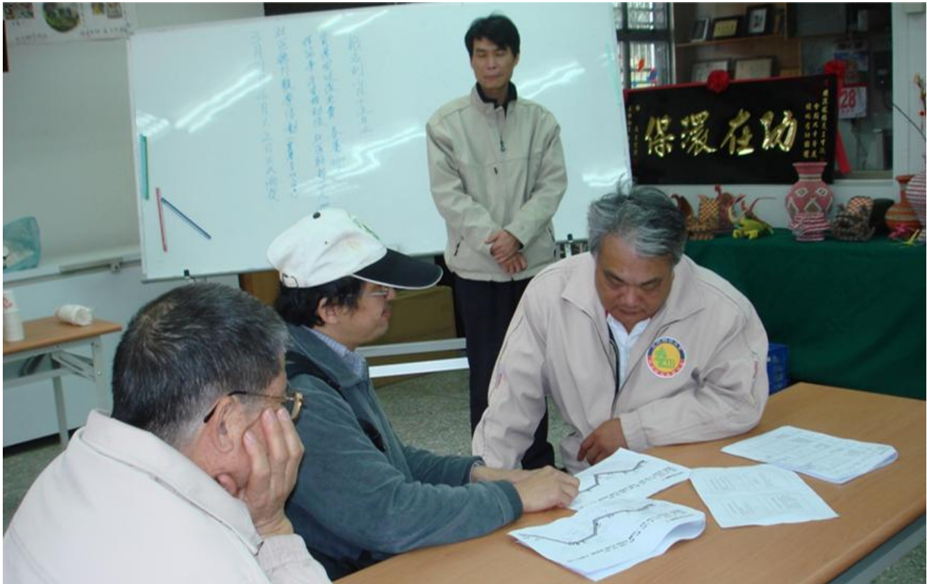
Picture 1: A focus group meeting held in Linmei Village to solicit community input on indicator measures and monitoring procedures