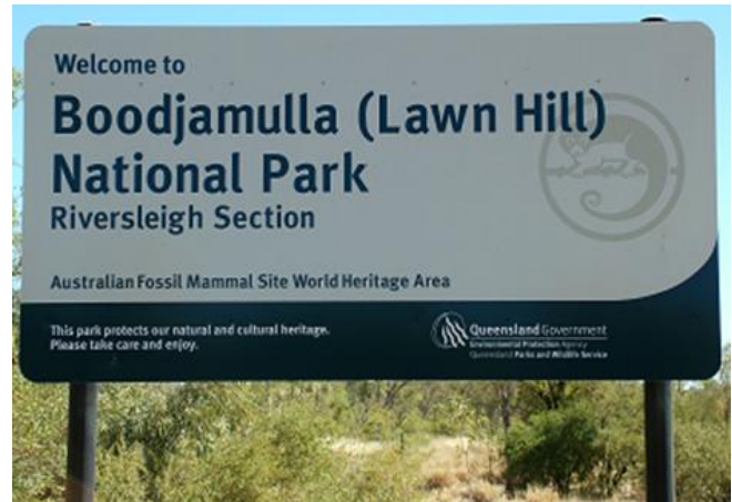
Picture 4. A large road sign welcoming visitors to Boodjamulla (Lawn Hill) National Park in far northwest Queensland.