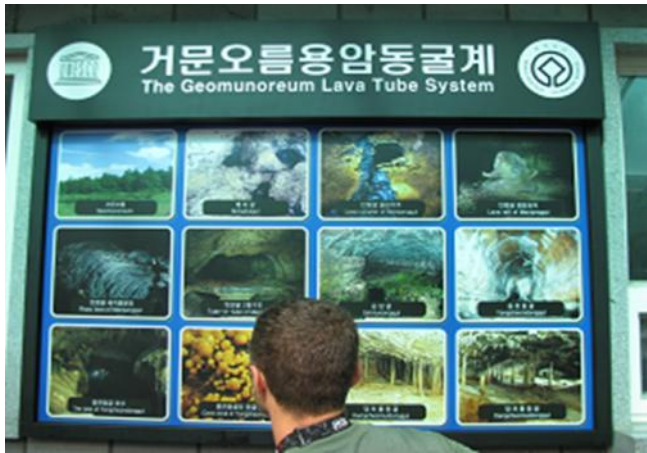
Picture 3. Visitor at Jeju Volcanic Island and Lava Tubes World Heritage Area reading a sign that includes the World Heritage emblem