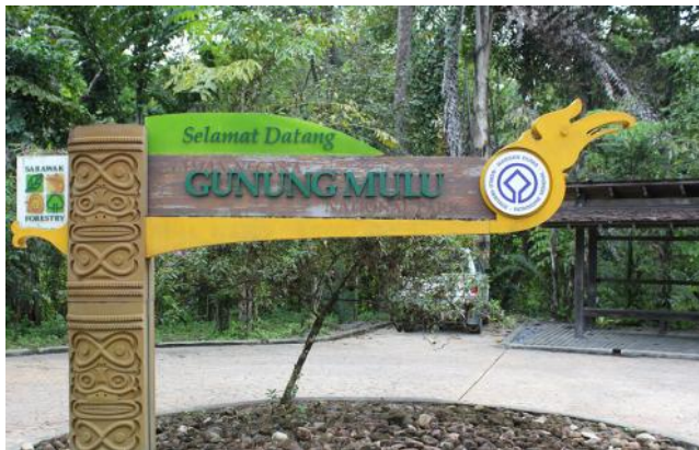
Picture 5. Gunung Mulu World Heritage Area is an example of best practice in World Heritage branding. The World Heritage name and emblem are prominently, consistently and repeatedly presented to visitors during a park visit and is found on entrance and interpretive signage, staff uniforms, the official park web site and more.