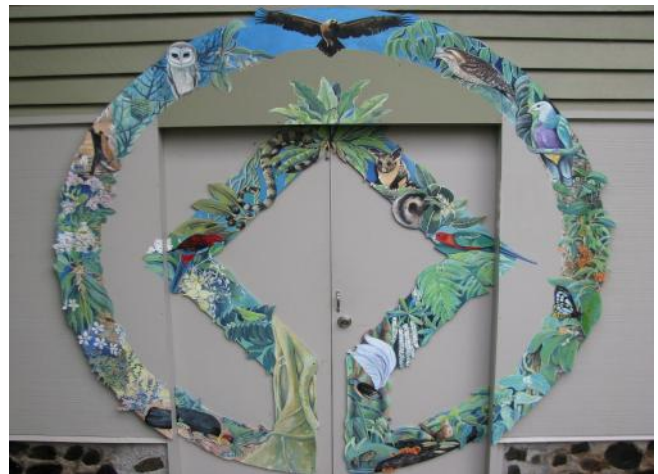
Picture 6. Teaching World Heritage brand values using imagery that forms the World Heritage symbol. This artistic piece is found within the Gondwana Rainforests of Australia World Heritage Site in Queensland, Australia.