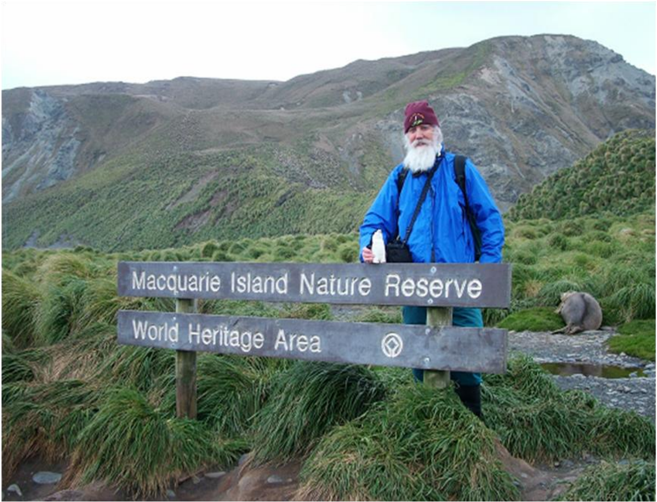
Picture 2. A World Heritage 'collector' proudly standing by the entrance signage to Macquarie Island, documenting his visit to this oceanic island located some 1,500 miles southeast of Tasmania and ticking one more World Heritage site off his list

The emotional part of a protected area brand consists of all the knowledge, factual and emotional, a visitor remembers about the brand. In other words, it is all the thoughts, feelings, associations and experiences a person has had with the protected area and its marketing efforts. The intangible value this adds to the brand is known as the brand's equity (Kotler & Keller, 2006). Brand equity begins when the mental components of the brand imprint themselves in the visitor's mind and are conjured up when the brand is somehow evoked (Keller, 1993). Once remembered, the brand's net equity has the opportunity to influence, either positively or negatively, the individual (Rossiter & Percy, 1997; see Picture 2). Overall positive brand equity stimulates affirmative thoughts and associations while prompting the visitor to behave in ways protected area managers prefer, while negative brand equity may provoke visitors to act inappropriately or visit elsewhere. Powerful brands have extremely positive brand equity (Kotler & Keller, 2009).