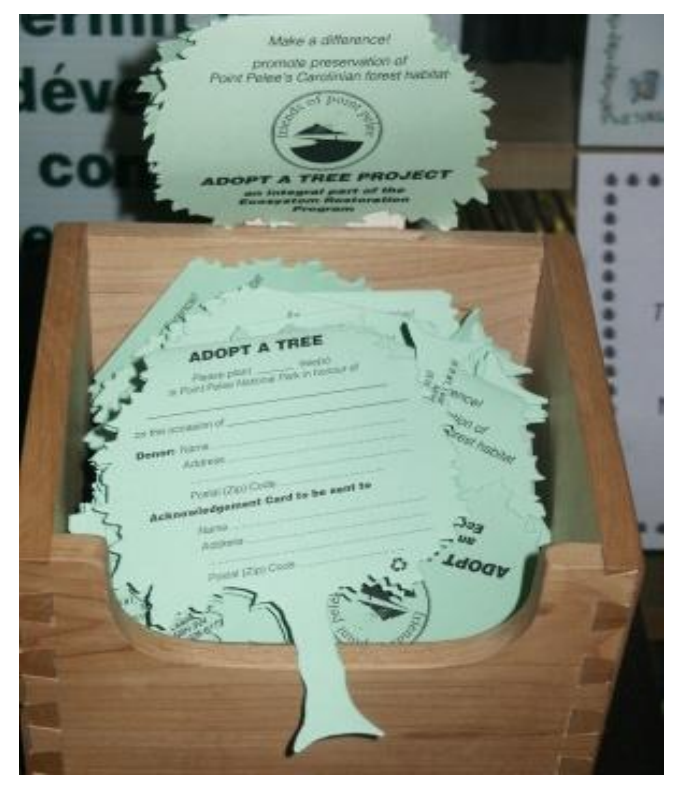
Fundraising programme at Point Pelee National Park, Canada

In some cases there have been changes in land tenure (Buckley, 2010b). For example, private individuals have donated land of high conservation value to a parks agency, but retained the right to operate tourist accommodation or activities. In other cases, public land has been transferred from production to protection, but with tourist rights granted to private entrepreneurs as part of a political package. In some countries, there were former hunting leases over areas now allocated to conservation, and these included rights to operate tourist accommodation. If declaration of a protected area halts hunting, lessees may sell their leases to non-hunting tourism operators, which