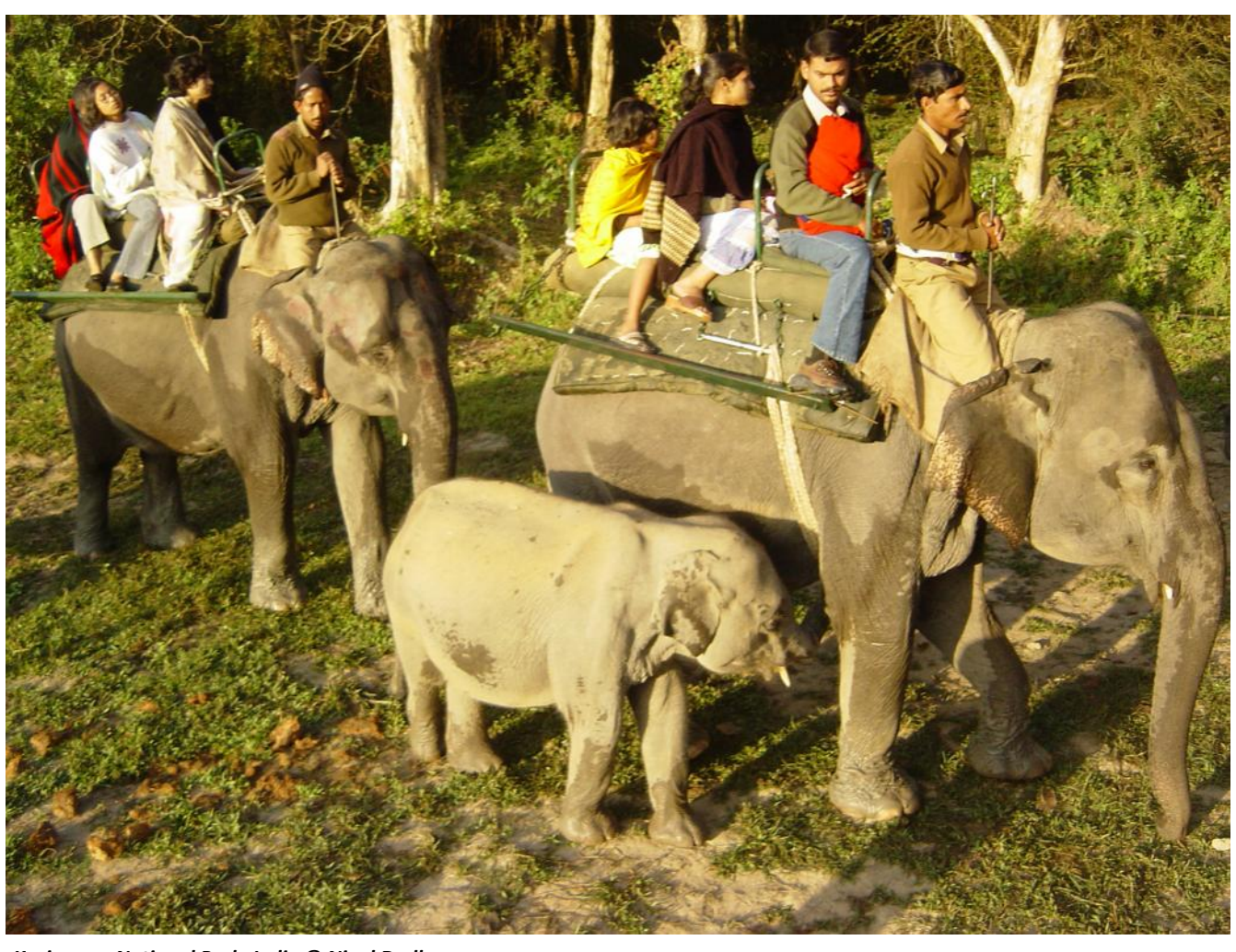
Kaziranga National Park, India

countries, she found that ecotourism employment resulted in more positive attitudes towards tourism and conservation, and that education played a key role. Similarly, Hussain and others assessed the contribution of tourism to local livelihoods in the region of Kaziranga National Park, a World Heritage site in India. Many nearby residents benefited from park tourism, and these benefits could increase if the leakages could be reduced through logistic support, proper marketing of local products, and strengthening of local institutions. Last, Salizzoni examines biodiversity conservation and tourism along the Euro-Mediterranean coast. Planning and management policies are needed to address the negative impacts of seaside tourism and to promote low impact tourism in the interior of this region.