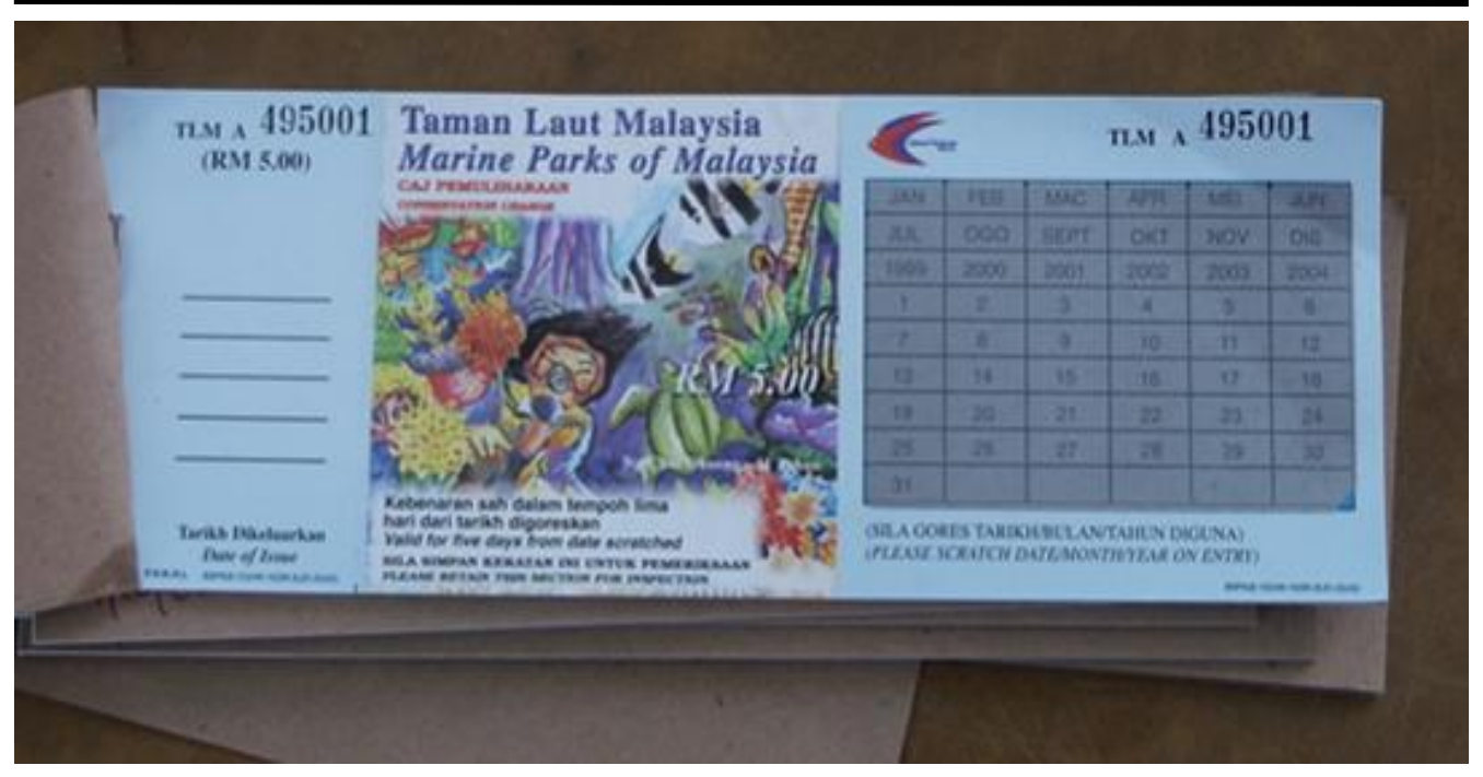
Entry fee tickets at Taman Laut Malaysia Marine Park

applications, tendering, or intermediaries such as NGOs. Incentives can include single or repeated payments, rate rebates and land-tax exemptions, or capital-loss deductions, sometimes saleable to third parties.