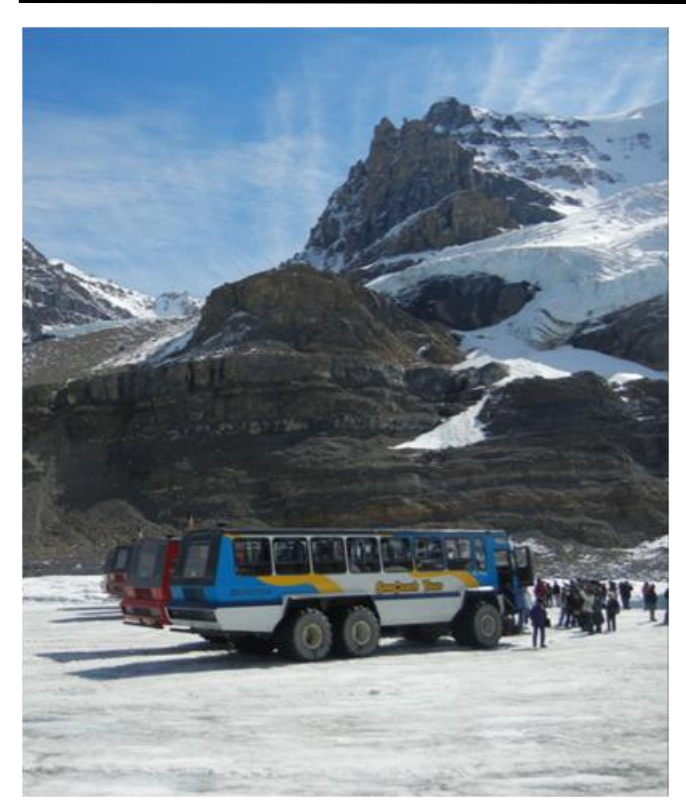
Private sector operator guiding tours to Jasper National Park's Columbia Icefields, Canada

every year. These domestic visitors share international interests in seeing native wildlife and engaging in various forms of outdoor recreation and commercial adventure tourism.