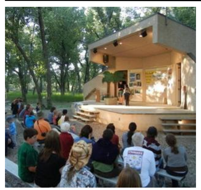
Interpretation programming at Dinosaur Provincial Park, Canada