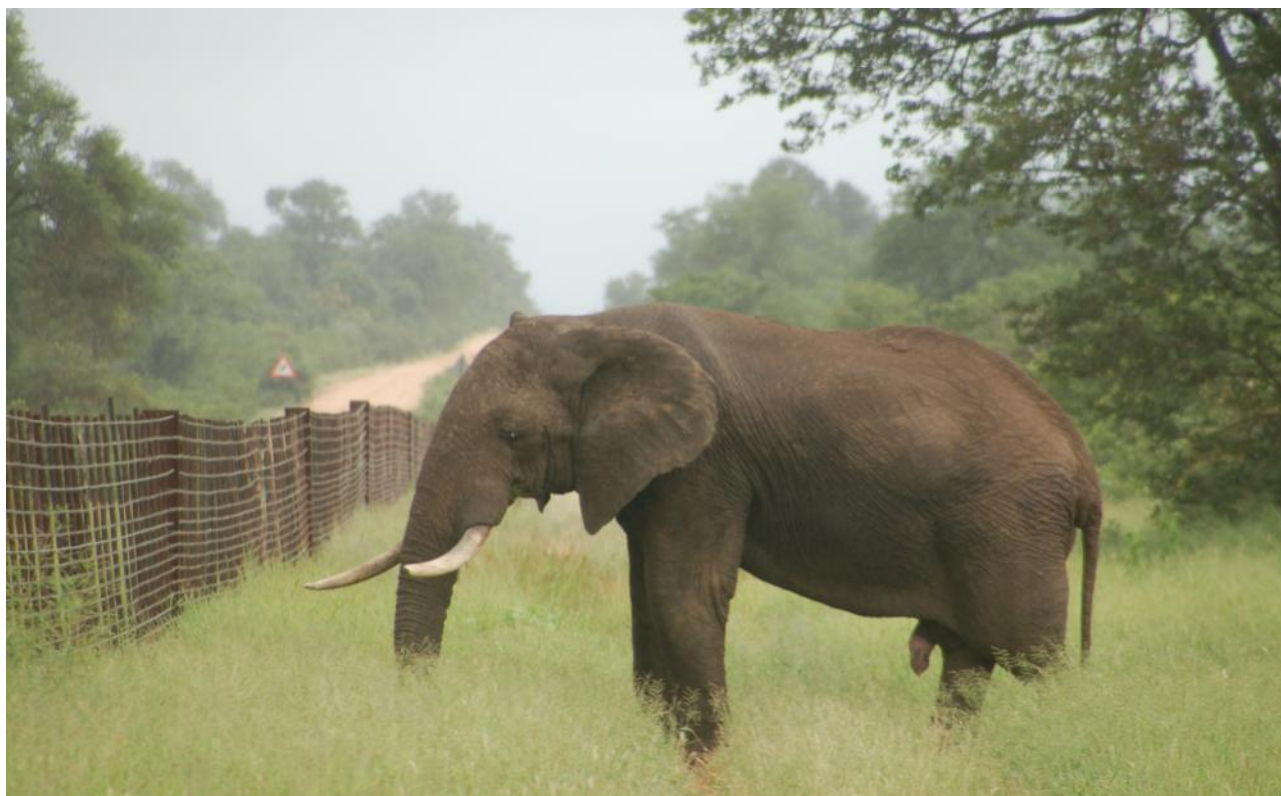
Elephant bull inspecting the new 'I' beam fence, Kruger National Park

versus the cost of the fence in terms of construction and maintenance. Ultimately, such a holistic economic approach should have the double benefit of discerning whether a fence upgrade is required or whether the fence itself is a financial burden with little efficiency. This fencing cost to benefit ratio should form part of the overall economic and financial estimation of using rangeland for livestock production as opposed to other land uses which may require less or no fencing, such as wildlife production.