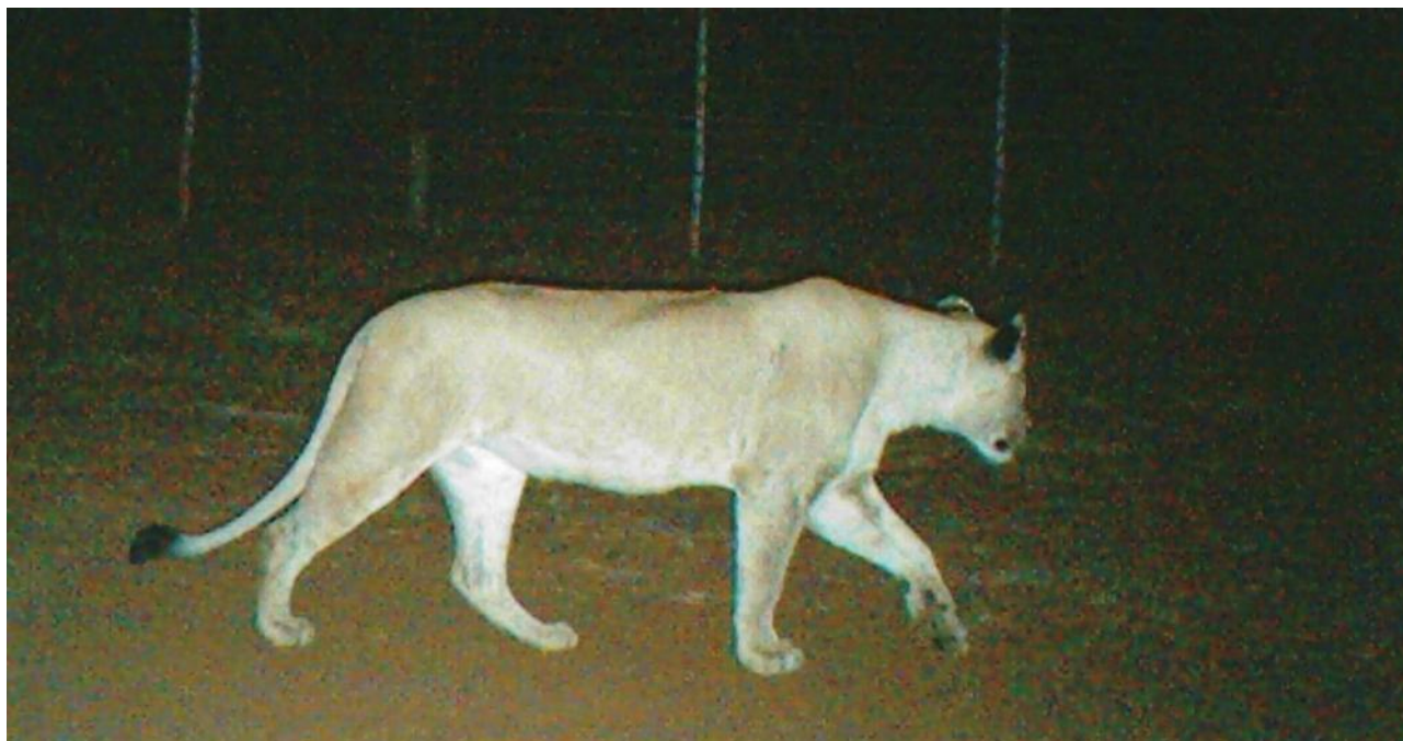
Lioness caught on camera trap leaving the KNP western fence to feed on livestock, it was killed the next night by local people using the poison carbofuran, the parks' first recorded case, her young cubs were never again located

live seasonally outside of the parks (Norton-Griffiths and Said, 2010). At this huge interface between state controlled conservation and a rapidly changing tribal or private system, conflict comes in many guises, all of which emphasize the nature of the competition for resources between people (and inter-group competition) and the remaining traditional wildlife and pastoral areas. In 21 st Century Kenya, fences are providing a way of privatizing and fragmenting the landscape (Kioko et al. , 2008) which historically parallels the role of fencing in the way that the 'American Wild West' was 'tamed' (Fleischner, 2010). Indeed Victorine and Curtin (2010) note that the 'wild west' is still being 'tamed' and fragmented by a new wave of fencing, erected for the sale of cattle ranches to urbanites, who wish to parcel them up still further into 'ranchettes'. The costs of the reorganization of land tenure in Africa, through the subdivision of land, in terms of reduced ecosystem goods and services is exemplified by the fact that at least 50 per cent of large mammal populations in these arid and semi-arid Kenyan rangelands which lie outside protected areas have declined in the last few decades (Norton-Griffiths and Said, 2010).