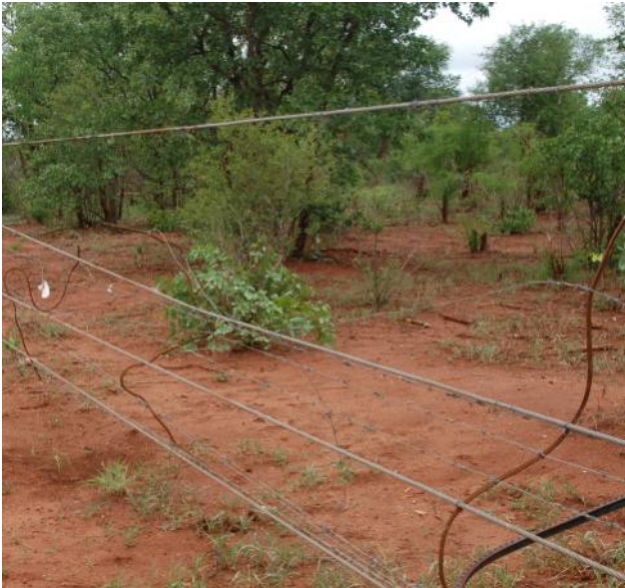
13mm cable fencing damaged by elephants at Kruger National Park

natural regulation of prey by introduced predators outweighs the cost to the public purse of the initial capital outlay.