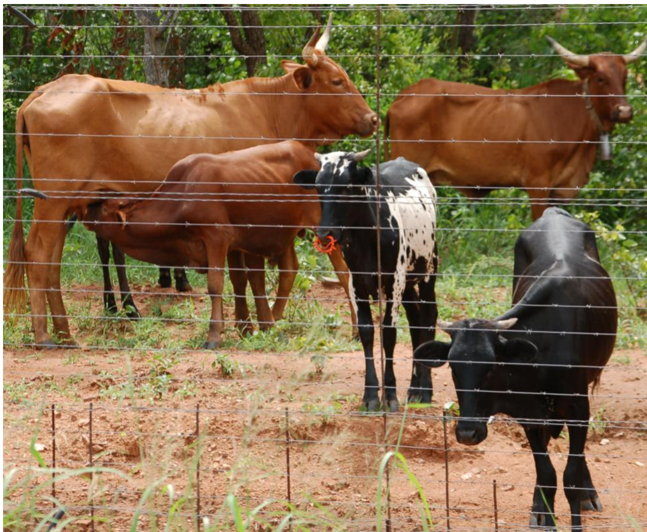
Cattle outside the fence at Kruger National Park

poisonings in the area. The win:win scenario would be that cattle are protected, free domestic gas produced, lions protected and there is less pressure on the riverine forests to produce charcoal in order to provide household energy.