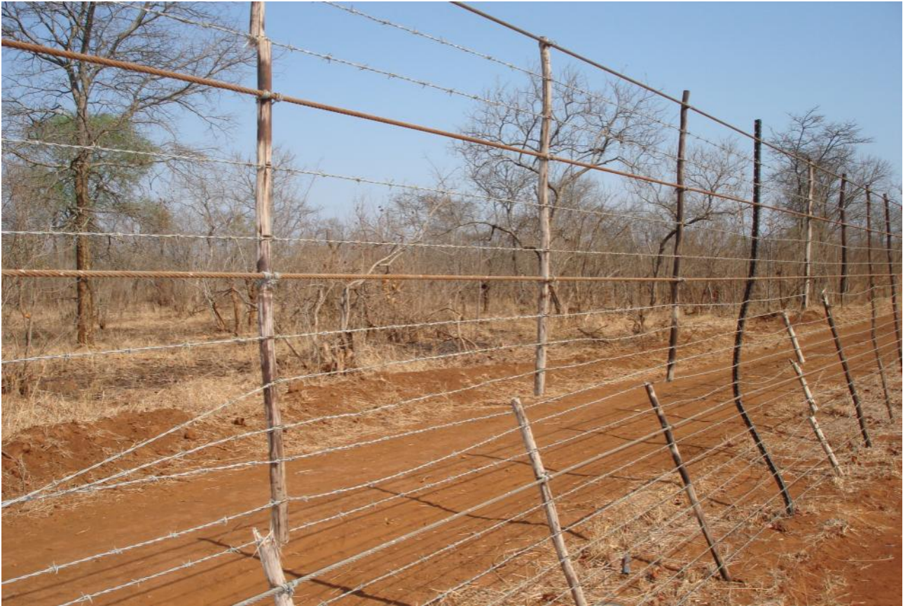
New fencing damaged by elephants at Kruger National Park

motivations. An additional factor is the difference between the use of fencing by the state and by private entities. The development of wildlife commercialism in South Africa is influenced by the use of fencing to control 'externalities' (such as laws requiring fencing, control of disease in a private area, etc.). In Zimbabwe such externalities " avoided the financial and ecological disadvantages of fences with a rather elegant common property solution " (Child, 2009; referring to game conservancies and community-based conservation). However, the downside to private fencing is the potential to fragment land into smaller parcels whereby overstocking and rangeland degradation may occur.