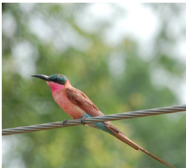
Carmine bee eater (Merops nubicoides) using a fence at Kruger National Park to hunt

which were placed to block the movement of large mammals and which inevitably fragment landscapes. Some of these types of fences are dilapidated and their status as effective barriers is largely unknown.