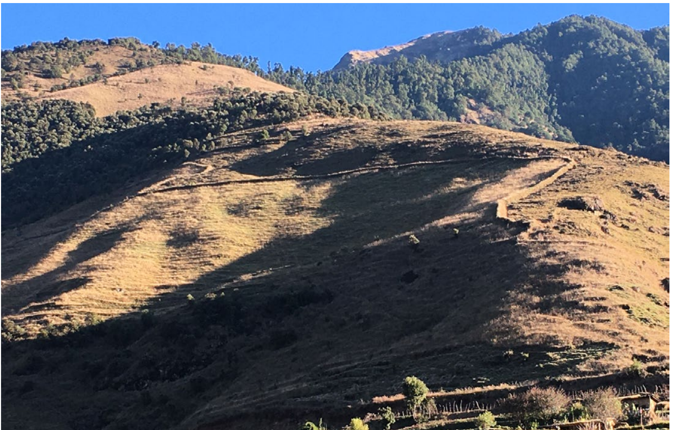
Pasturelands within Dhorpatan Hunting Reserve