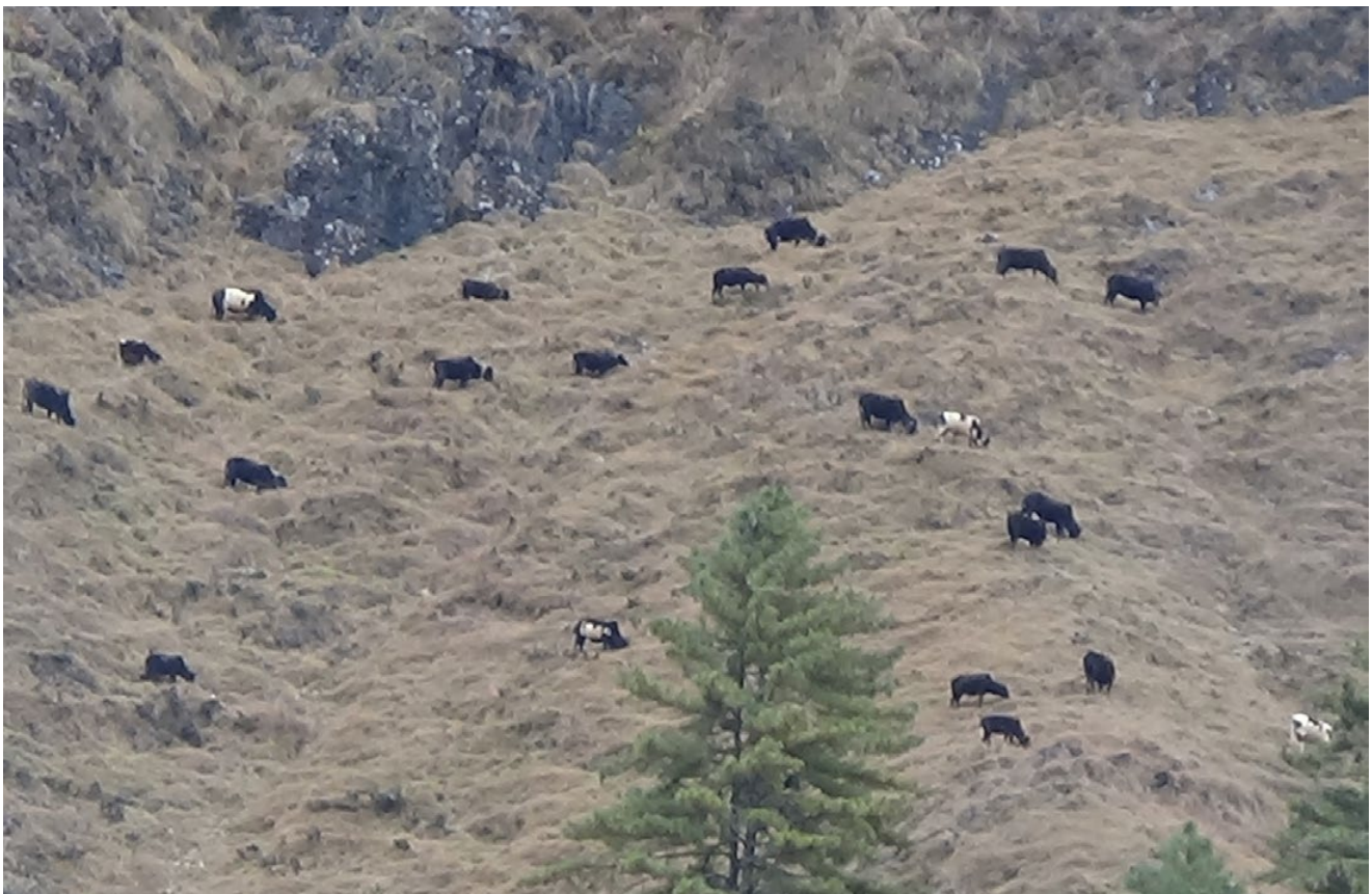
Animals grazing in the Dhorpatan Hunting Reserve highlands