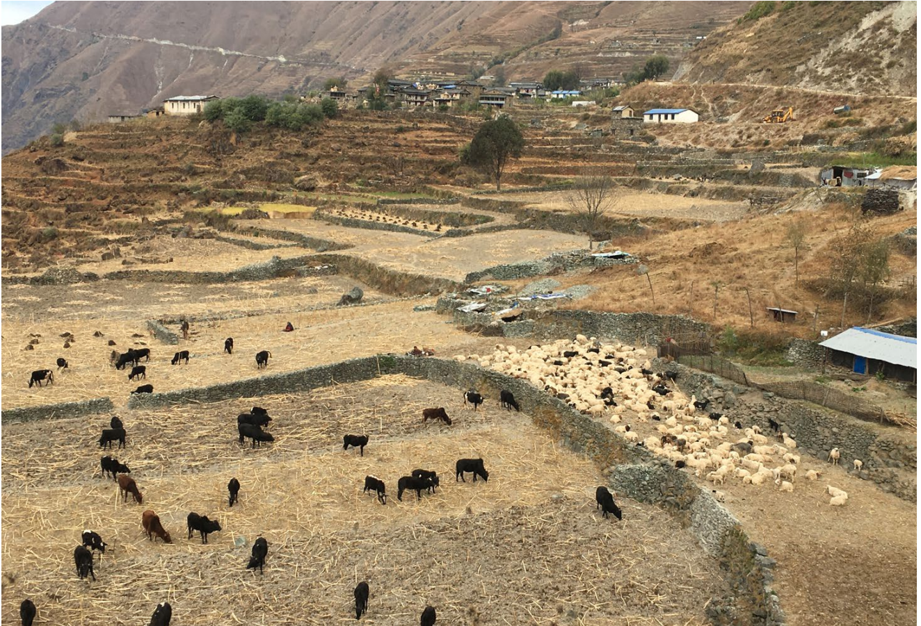
Herds of animals in a low valley of the Dhorpatan Hunting Reserve