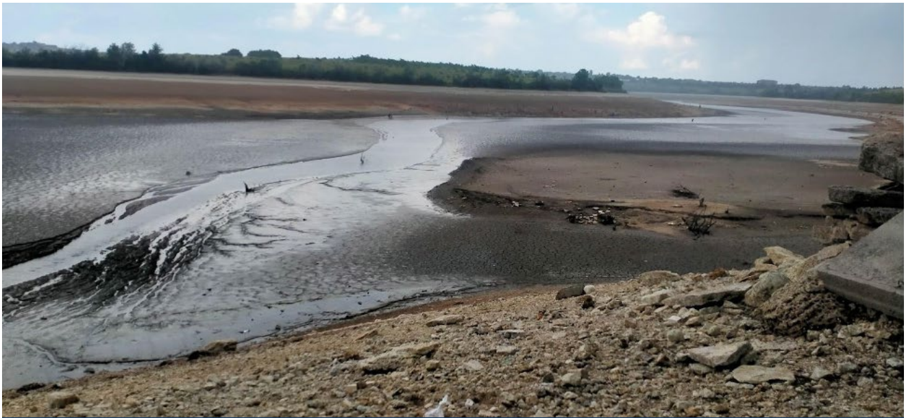
The dry basin of Kamianska Sich NNP after the Kakhovka dam explosion

in the sands of beaches, hidden in the vegetation of forests and grasslands and floating mines are in rivers, lakes and the Black Sea (Chernysh, 2023; The Maritime Executive, 2023). In addition to actively mined areas, unexploded munitions (missiles, bombs and shells) now litter much of Ukraine’s environment. Of the 67,000 or so shells that land on Ukraine each day, the ‘fail rate’, that is the number of munitions that will not detonate on impact, ranges between two per cent for the modern NATO supplied shells to 30 per cent for older Soviet Union weaponry (confirmed by our team, 2023).