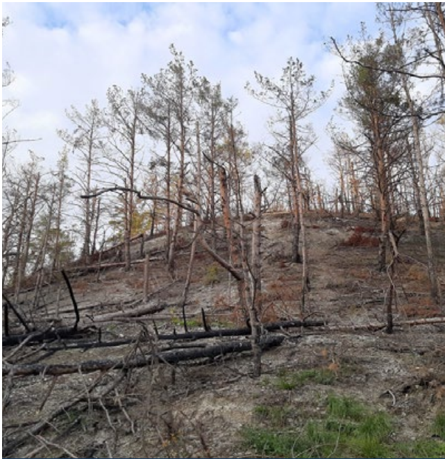
The result of a forest fire caused by the invasion in Sviati Hory NNP

(Ukraine War Environmental Consequences Work Group, 2023). Thirteen PAs reported damaging fires from hostilities, these include over 31,761 ha of radiation-contaminated forests and 8,695 of grasslands in the Chornobylskyi Radiation and Environmental Biosphere Reserve (ID:555719480; confirmed by our team, 2023).