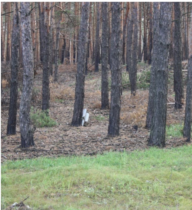
Unexploded munition on a tree, image taken from the road

in the sands of beaches, hidden in the vegetation of forests and grasslands and floating mines are in rivers, lakes and the Black Sea (Chernysh, 2023; The Maritime Executive, 2023). In addition to actively mined areas, unexploded munitions (missiles, bombs and shells) now litter much of Ukraine’s environment. Of the 67,000 or so shells that land on Ukraine each day, the ‘fail rate’, that is the number of munitions that will not detonate on impact, ranges between two per cent for the modern NATO supplied shells to 30 per cent for older Soviet Union weaponry (confirmed by our team, 2023).