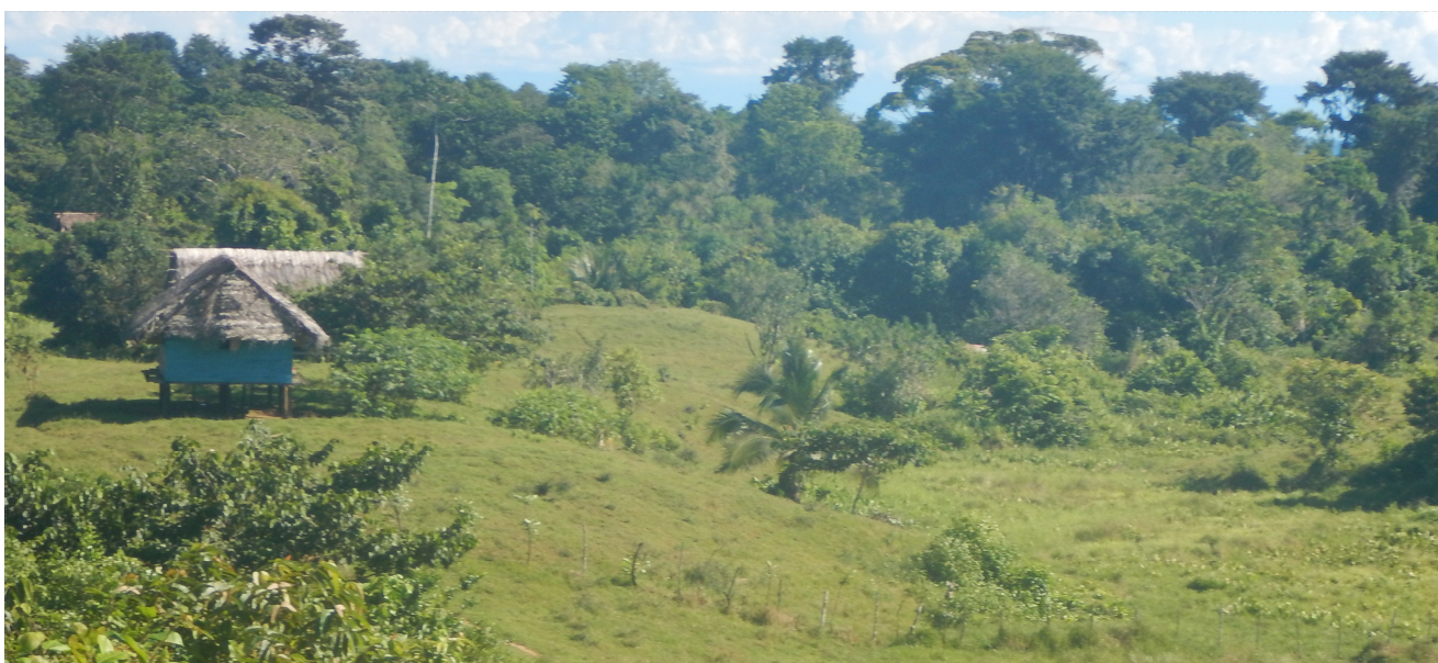
Salt Creek, a Ngäbe village consisting of about 60 houses located on the southeastern end of Bastimentos Island © Ted Lawrence

also trained over the same period in basic knowledge of local natural history and land use. Further, preliminary field data collection was conducted over several days to customise the protocol to our study site's socio-environmental context; for intercalibration of the protocol among the research assistants; and to address any difficulties that may have arisen in the implementation of our landscape assessment protocol in varying locations. Ultimately, our rapid visual assessment was conducted through transect walks with local informants at 11 field sites. Each field site corresponded to human settlements and/or accessible park boundaries. Local informants guided our field team across each site as we visually identified dominant land uses and collected data approximately every 200 m within different land-use/cover types for a total of 91 data collection points. Figure 1 shows the areas on Bastimentos Island where all data were collected relative to the park boundaries.