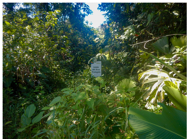
Boundary of Bastimentos Island National Marine Park in Bahia Honda on Bastimentos Island