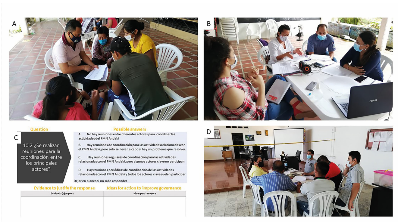
Figure 2. SAGE assessment workshop

The group approach allowed for substantial interaction between different organisations and groups of actors, which contributed to a good understanding of the issues and encouraged the input of all participants. The methodology also allowed different actors to articulate