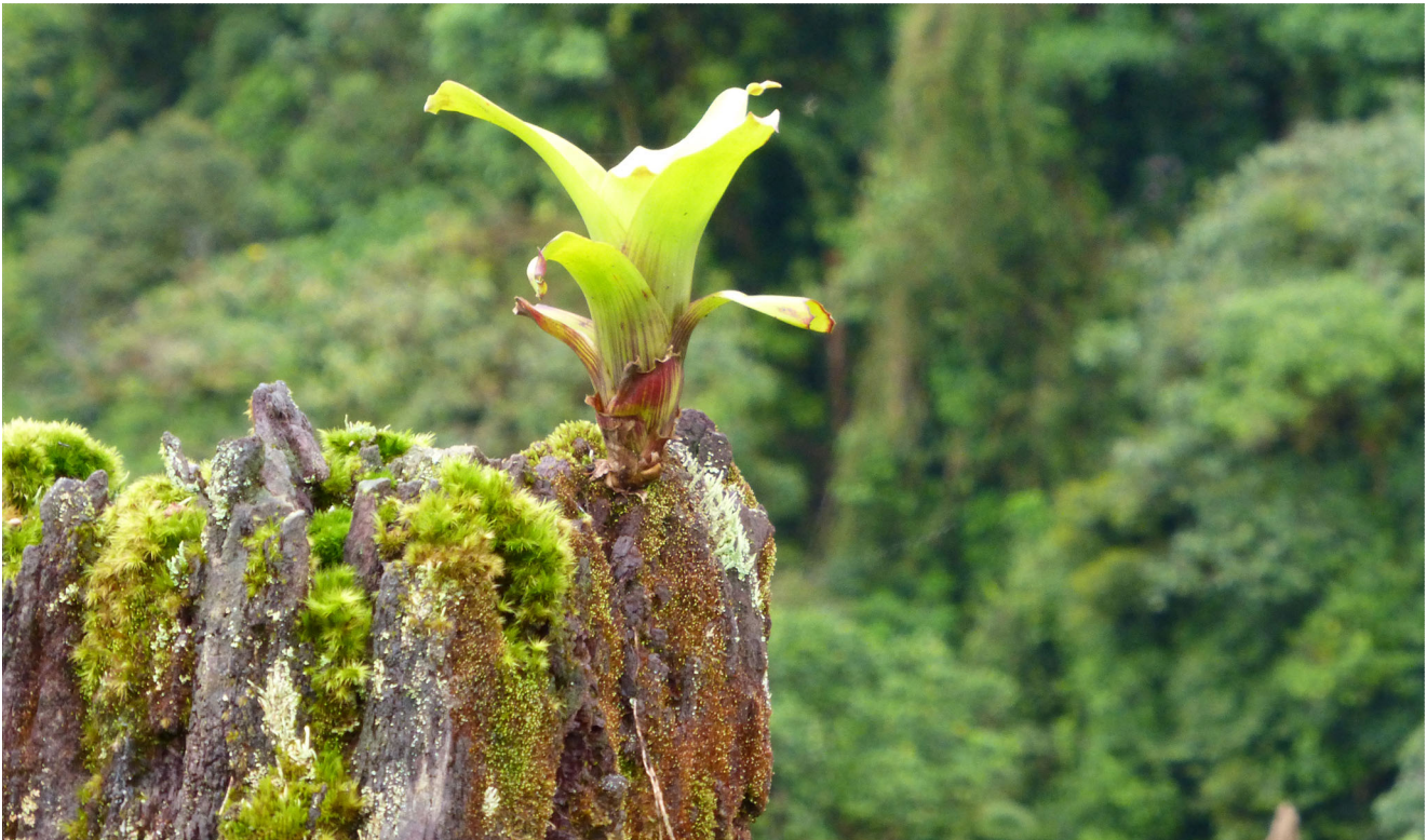
Bromelia Andakí Trail, Andakí Municipal Natural Park

effective contribution to in situ conservation of biodiversity, associated ecosystem functions and services, and cultural, spiritual, socio-economic and other locally relevant values. The evaluation could highlight important aspects that need to be enhanced in the future to maintain these conditions in the long term. We suggest that the methodology should be tested in other potential and candidate OECMs in order to gain more insights into how it will help governments and other actors to apply the OECM criteria.