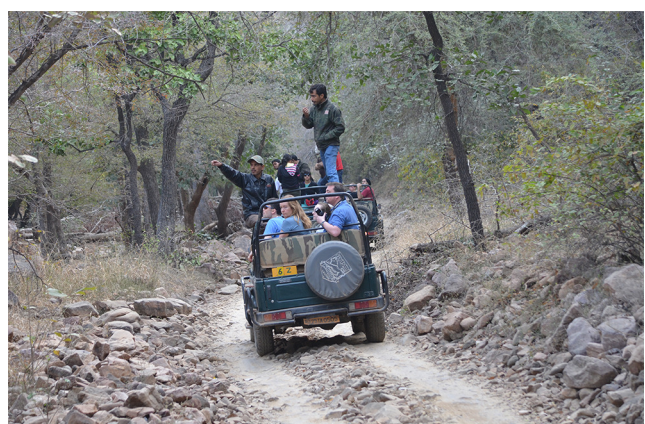
Ranthambore National Park usually provides income for hoteliers, guides and restaurants, catering to an increasing domestic wildlife tourism market in India

This survey was completed by protected area managers, rangers, and civil society supporting protected area management in government-managed protected areas. A total of 77 responses covering 40 PCAs were received from 12 out of the 13 Tiger range countries. Many reported that COVID-19 had impacted on funding and staff responsibilities and welfare, thereby compromising the ability of PCAs to achieve their conservation goals. It was reported that rangers were stretched and their jobs had become more difficult, with new duties allocated, including unfamiliar ones such as community health checks (see also Singh, in this issue). The provision of key supplies and equipment was disrupted in 60 per cent of PCAs, budget cuts were experienced in nearly half of them and community engagement activities stopped in 75 per cent. Nonetheless, the level of patrol coverage was reported to be stable and there was no