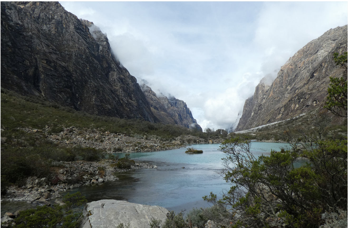
Huascarán National Park, Peru

Many changes instituted under COVID-19, or highlighted for development, were already either underway or recognised as necessary before the pandemic. The main long-term effect of the pandemic may have been to accelerate these changes. Principal among these is a switch to greater reliance on remote or home working, which many PCA agencies say will continue to some extent. There are clear limitations in terms of fieldwork and patrolling but opportunities in other areas, although even remote field working is becoming more practicable, with electronic monitoring and surveillance systems becoming cheaper and better all the time. A switch to online learning, including