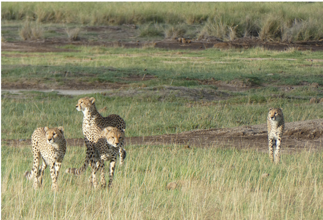
Many protected areas provide sources of income for local communities through tourism that have proved irreplaceable in the short term. Cheetahs, Amboseli National Park, Kenya

revenue generation from tourism and other sources, monitoring the illegal wildlife trade, and security intelligence. More than 60 per cent noted impacts on investigations of suspected illegal activities, training programmes, research and monitoring, the security of tourists and tourism-related facilities, and conservation work outside PCAs. Impacts on the protection of endangered species, conservation education and outreach, regular field patrols and anti-poaching operations were reported in more than 50 per cent of cases. Between 50 and 70 per cent of countries also reported high impacts on collaboration with stakeholders: these affected work with governmental bodies and local communities in more than 60 per cent of cases; whilst collaboration with private landowners, researchers and non-governmental organisations was affected in more than 50 per cent of cases.