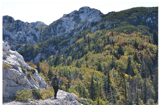
Some protected areas in southern Europe reported heavier than usual visitation during the relaxation of lockdown in summer 2020. Velebit National Park, Croatia

The ten surveys comprised eight regional and two global assessments. Africa's survey was conducted by the IUCN-World Commission on Protected Areas (IUCN-WCPA) in collaboration with the African Wildlife Foundation and completed by the directors of protected area agencies in April 2020. IUCN carried out a similar survey for the Asia Protected Areas Partnership (APAP) targeting PCA agencies in the region in June 2020. A survey in Tiger range countries was conducted in May-June 2020. MedPAN, the network of marine protected area managers in the Mediterranean countries, launched a survey focusing on marine protected areas (MPAs) in the region in May. The rest of the surveys were carried out between June and August 2020. They include the Oceania survey that focused on public, private and Indigenous protected areas, along with community managed areas and locally managed marine areas. The North American questionnaire conducted by IUCN-WCPA was sent to all protected area agencies and related bodies in Canada and the USA, while the LAC survey, carried out by REDPARQUES and targeting its