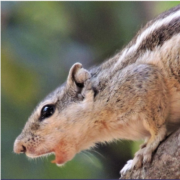
Rodents are among the most significant zoonotic pathogen hosts worldwide. Palm squirrel, Hyderabad, India

complement these restoration efforts and amplify large-scale rewilding initiatives that support landscape immunity benefits.