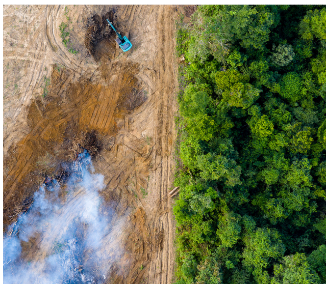
Agriculture is one of the most significant drivers of deforestation globally

Wildlife stressed by the environmental conditions associated with land use change can lose immunity and become more susceptible to zoonotic pathogen infection (Sapolsky, 2010; Becker et al., 2020; Nelson et al., 2020; Seiler et al., 2020). Stress can increase the likelihood that wildlife will release (shed) pathogens that lead to the infection of other animals of the same or different species, including humans (spillover). When land use change increases interaction between infected animals and people, it is more likely that zoonotic pathogens will cross over into human populations. The rate and scale of pathogen spread in human populations is largely driven by human social behaviour (the greater the contact rates among humans, the higher the likelihood of pathogen transmission) and pathogen biology (e.g., ability to transmit before symptoms are evident). Urbanisation and other land use changes increase human population density, thus increasing the risk of infection. Today, advances in human transport technologies and globalised consumer patterns spread