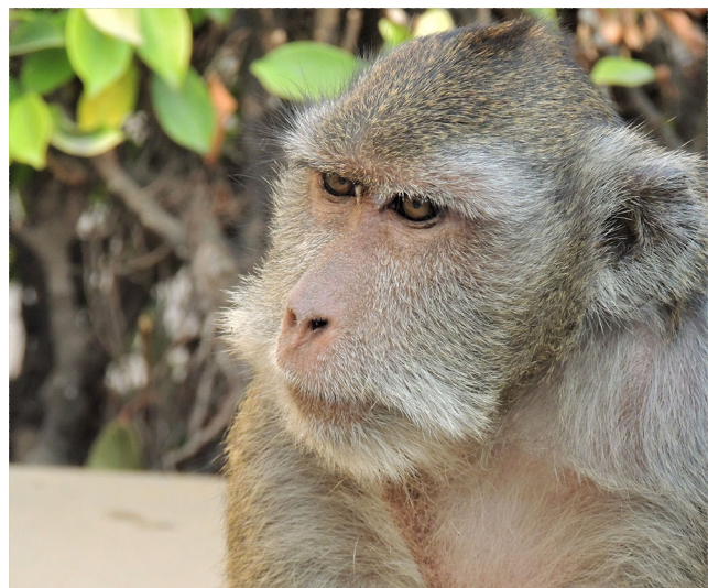
Zoonoses risk management strategies for primates living in proximity of human populations are vital. Long-tailed Macaque, Kuala Lumpur, Malaysia

The COVID-19 pandemic demonstrates the need for governments, donors and research institutions to overcome the social, technical and financial barriers to surveillance of wildlife species that serve, or may serve, as zoonotic pathogen hosts. The U.S. Agency for International Development’s Emerging Pandemic Threats PREDICT program 4 , which ran from 2009 to 2019, aimed to identify and map wildlife pathogens with