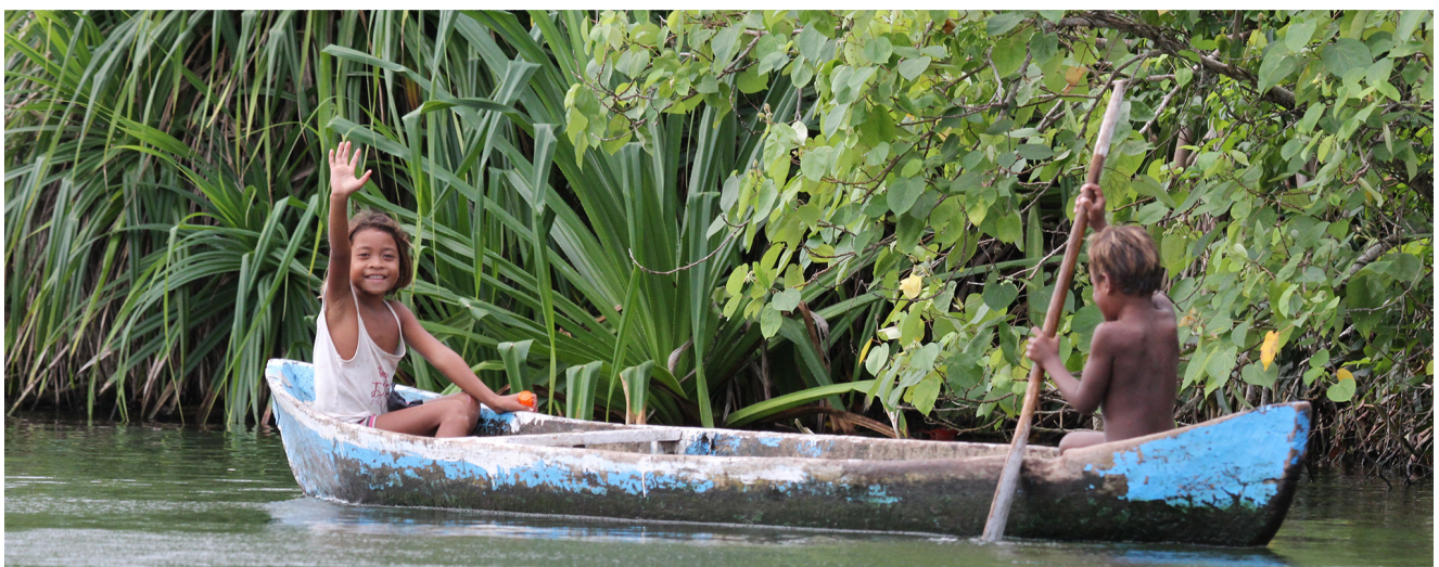
We have a duty to protect and conserve for future generations. East Rennell World Heritage Site, Solomon Islands

Having been part of this hopeful and urgent work during 2020, I can attest that youth are ready for the decisions, conversations and challenges that 2021 will bring. The question now is whether world leaders are ready too: whether they will mirror – or overlook – the courage, collaborative spirit and boldness displayed by our tenacious generation.