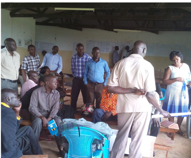
Consultations and participatory planning with Sub-county level Technical Staff and Political Leaders

With stakeholders, we tried to establish what the future of the landscape should look like and identify what needed to change to achieve that vision. At the District Local Government level, stakeholder engagement and dialogues were conducted for each district. The identification of participants was done in collaboration with District Local Government officials and members of the Core Planning Team. At the sub-county level (also known as Lower Local Government), consultations involved parish chiefs, cultural leaders and CSO