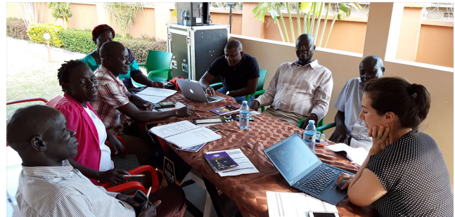
Core Planning Team during Writeshop to review the Draft Landscape Management Plan

Limited resources: Given the need for detailed consultations and planning with multiple stakeholders and at different scales and levels, commensurate resources are required. The landscape approach needs time and the appropriate implementation and uptake at each level and by many institutions. For example, in Uganda, obtaining the four District Council's Resolutions for the Landscape Management Plan approval process may take six steps. Many levels are consulted for approval, and debates are required to develop and approve reports at each stage. In most instances, the NFA representative, Forestry Sector Support Department and project leaders must be present at key Council meetings.