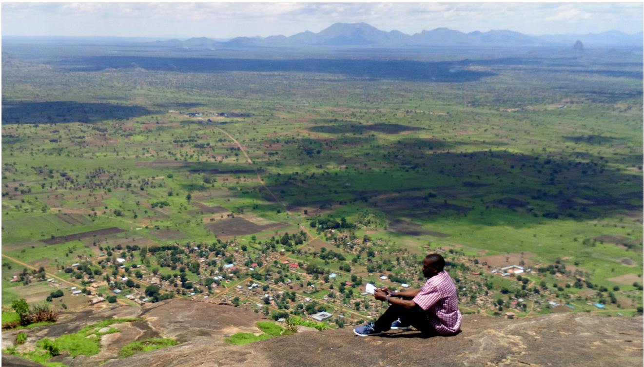
The Agoro-Agu Landscape

Forest Management Plan (Republic of Uganda, 2019). The three main land use types in the Agoro-Agu Sector are small-scale cultivation (37.5 per cent), grassland (12.5 per cent) and woodland (43.8 per cent).