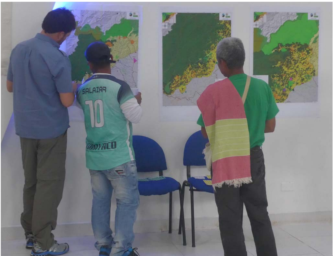
Social assessments (here of protected areas benefits in Colombia) are increasing being seen as important components of protected area management