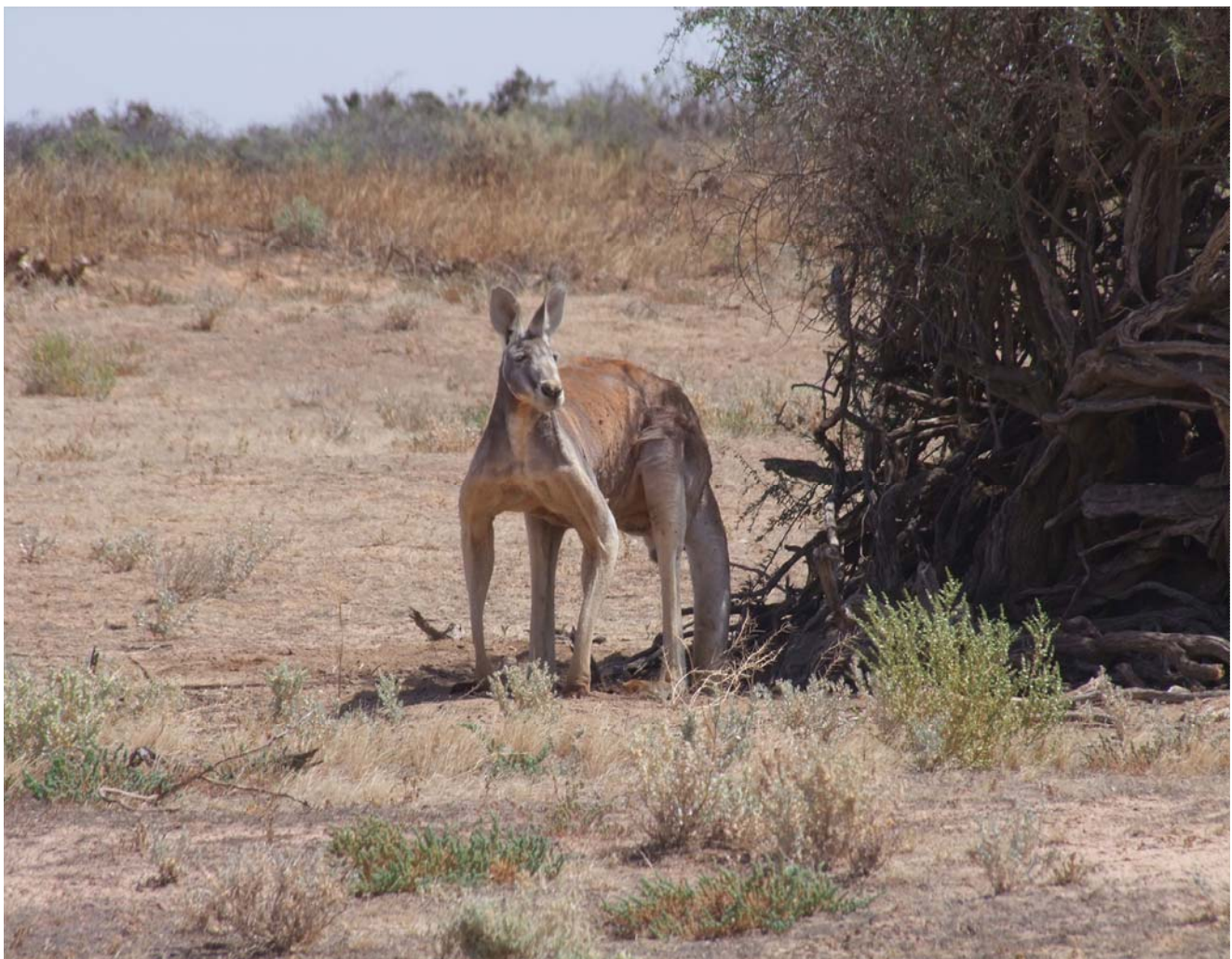
Figure 3. Red Kangaroo on Neds Corner Station, a property purchased by Trust for Nature (Victoria) with funds from the National Reserve System Program and thus a privately protected area

the conservation covenanting programmes, hence dividing into those that would qualify as PPAs (elaborated in Table 3 in Fitzsimons, 2015) and those that would not (Table 5 in Fitzsimons, 2015). While not qualifying as PPAs, these other conservation covenanting programmes would most likely be OECMs on private land. It is important to note that these other covenant mechanisms are effectively managed in the same way as other conservation covenants (and indeed some may have similar recognition under tax deductions/financial incentives; Smith et al., 2016; Department of the Environment and Energy 2018).