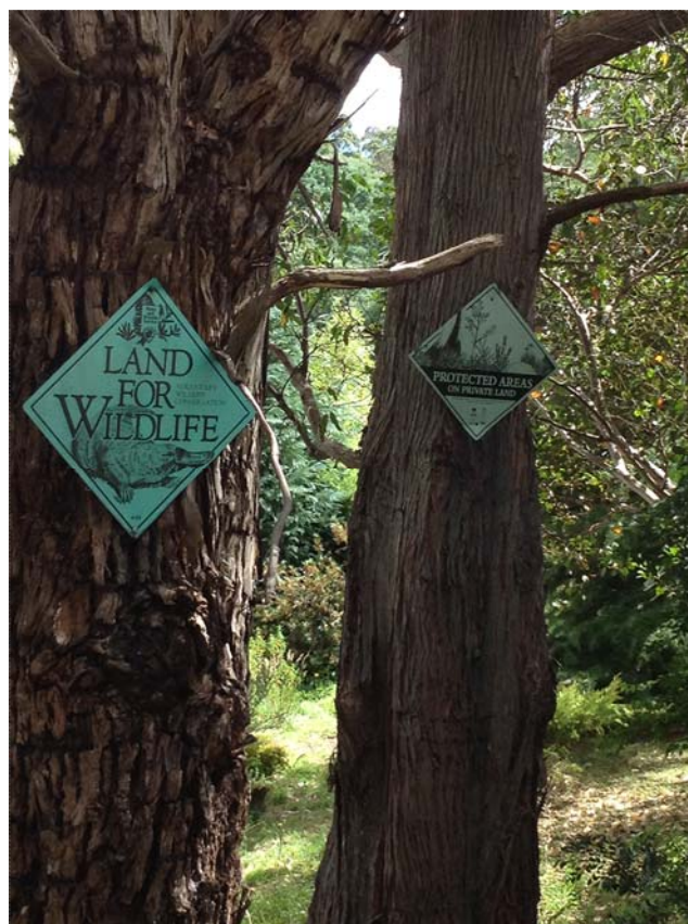
Figure 2. A conservation covenant in Tasmania, Australia: a property managed for the primary purpose of conservation with a secure agreement which runs with the title of the land and thus a privately protected area

However, not all conservation covenanting programmes would necessarily qualify as PPAs due to either the primary purpose or the level of authority identified in