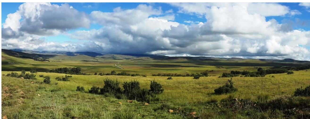
A privately protected area in South Africa's Grasslands

advocate for the use of a more user-friendly term, for example, 'conserved area' (Jonas et al., 2017). While clearer language for any classification is to be encouraged, it will be important to avoid creating confusion for practitioners and policy makers by using very similar terms (e.g. 'privately protected area' and 'privately conserved area' – there is likely to be little distinction between the terms 'protected' and 'conserved' for most people). Consultation on suitable terms (beyond the already agreed term OECM) will be important to avoid this confusion, acknowledging the clear acceptance and currency of the term privately protected areas already in existence. As the definition of conserved areas on private land that are not PPAs becomes clearer and formally accepted, it may become easier to grasp the differences between the two. While similar in many respects, the touchstone is the definition of a protected area. Privately protected areas satisfy that definition. Areas that do not may be OECMs on private land.