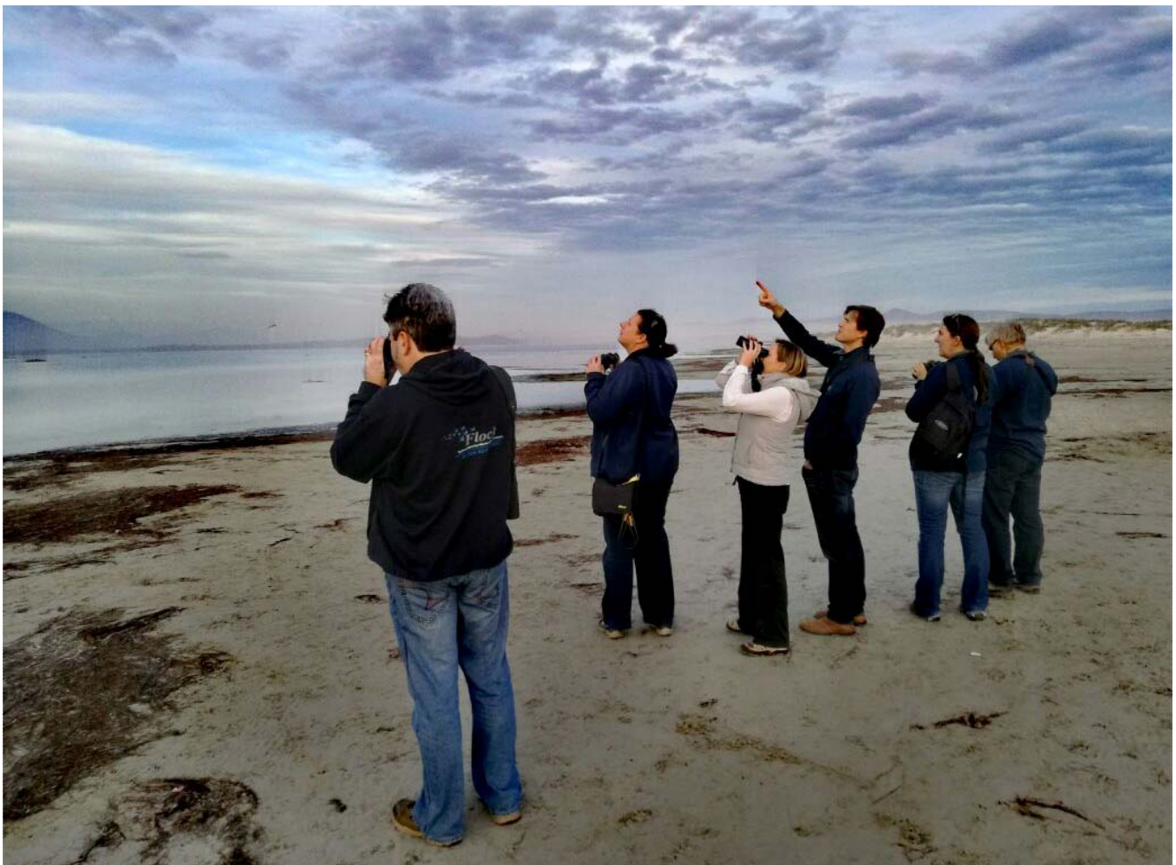
Using privately protected area models in South Africa to conserve estuaries

It should be recognised that despite the definitions being standardised by IUCN, the term 'privately protected areas' is often used more broadly for private land conservation mechanisms that include a legislative or contractual component (even if not in perpetuity) or generally for land owned by conservation land trusts or similar (Fitzsimons, 2015). Similarly, 'OECM' is not a term used by public or private land conservation practitioners. While definitional work continues, some