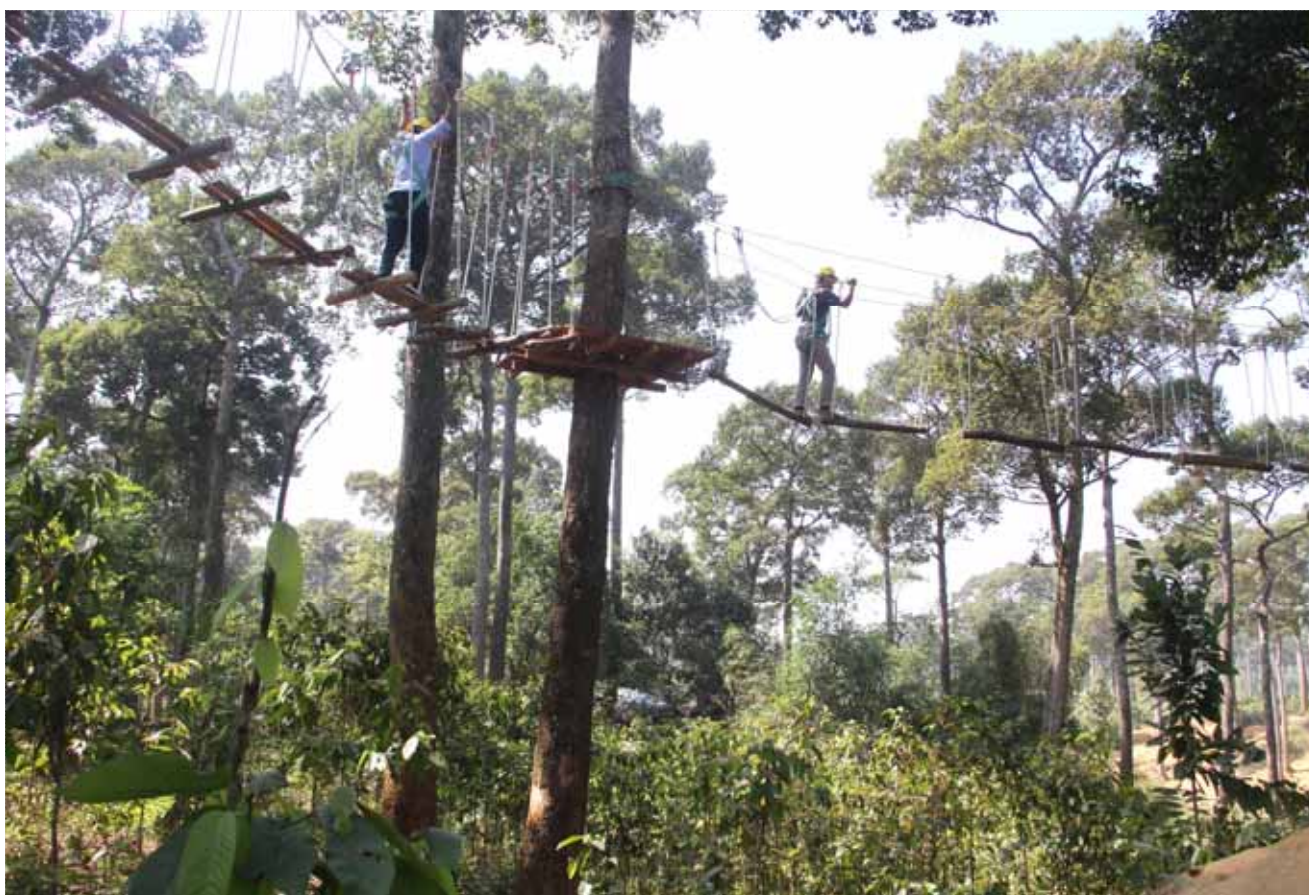
Ecotourism facilities in protected areas provide income generation to sustain collaborative management in Bangladesh.