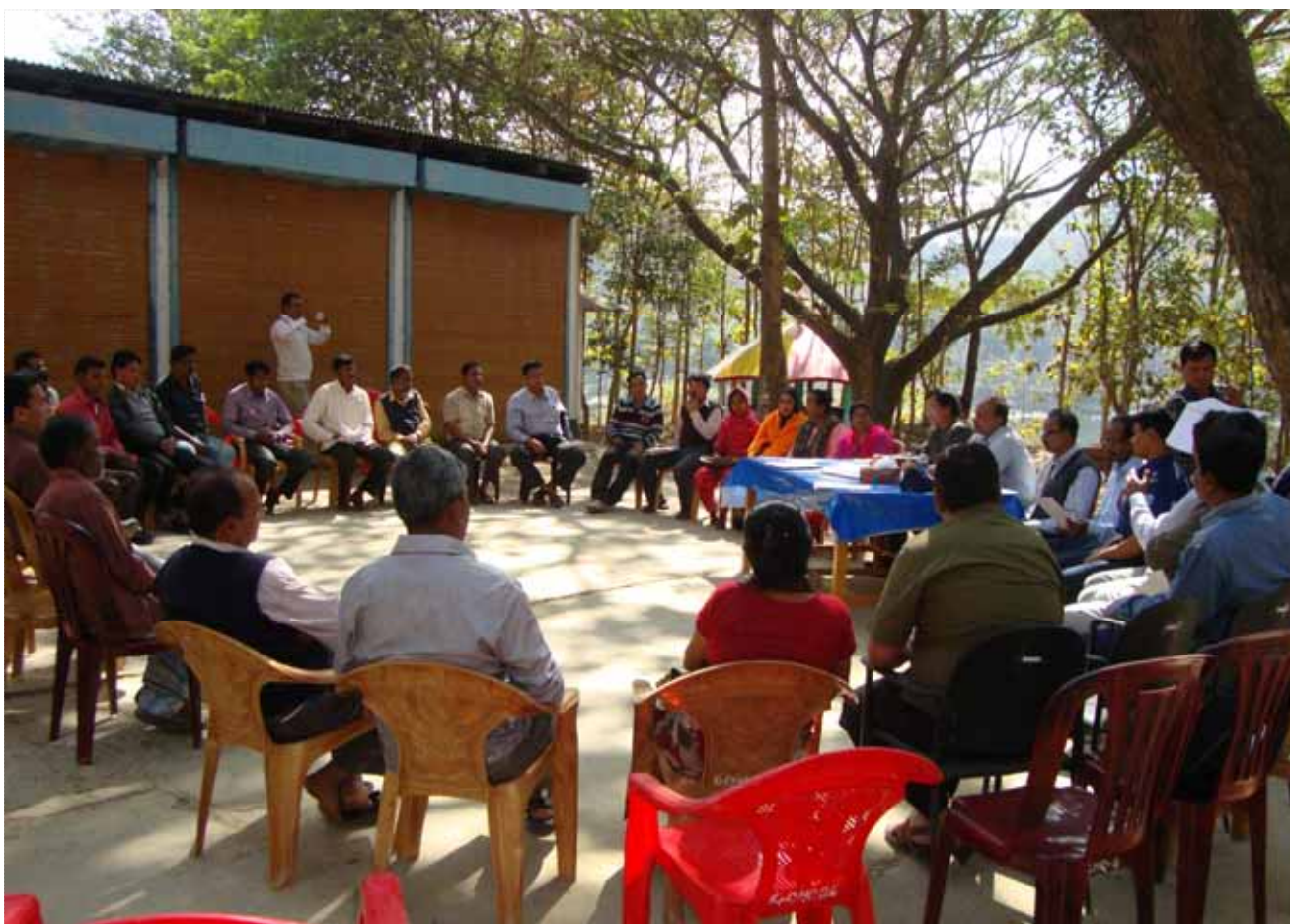
Monthly Co-Management Committee (CMC) meeting including Forest Department staff, community representatives, civil society and law enforcing agency staff