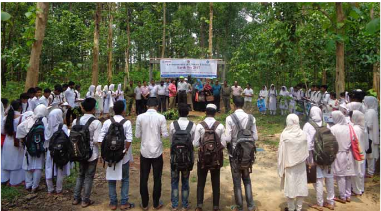
Educating school children during Protected Area visit

Traditional utilisation of non-timber forest products from the forest protected area system of Bangladesh