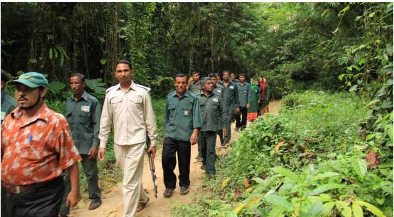
Joint patrolling at protected areas, community people and Forest Department staff

Ecotourism represents one of the most viable options for delivering benefits to the local communities in protected areas (Nagothu, 2001; Fox et al., 2007; Haider & Kabir, 2014). Revenue sharing from ecotourism will assist in