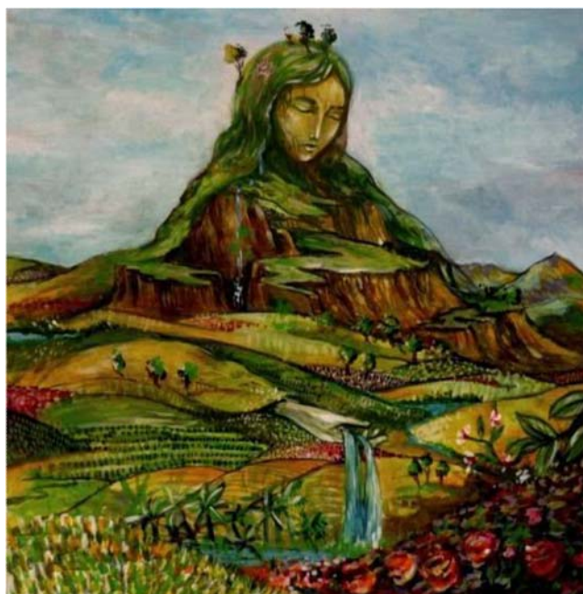
Bolivia enshrined natural world's rights with equal status for Pachamama in 2010.

Furthermore, the government appointed an ombudsman to defend or represent Mother Earth.