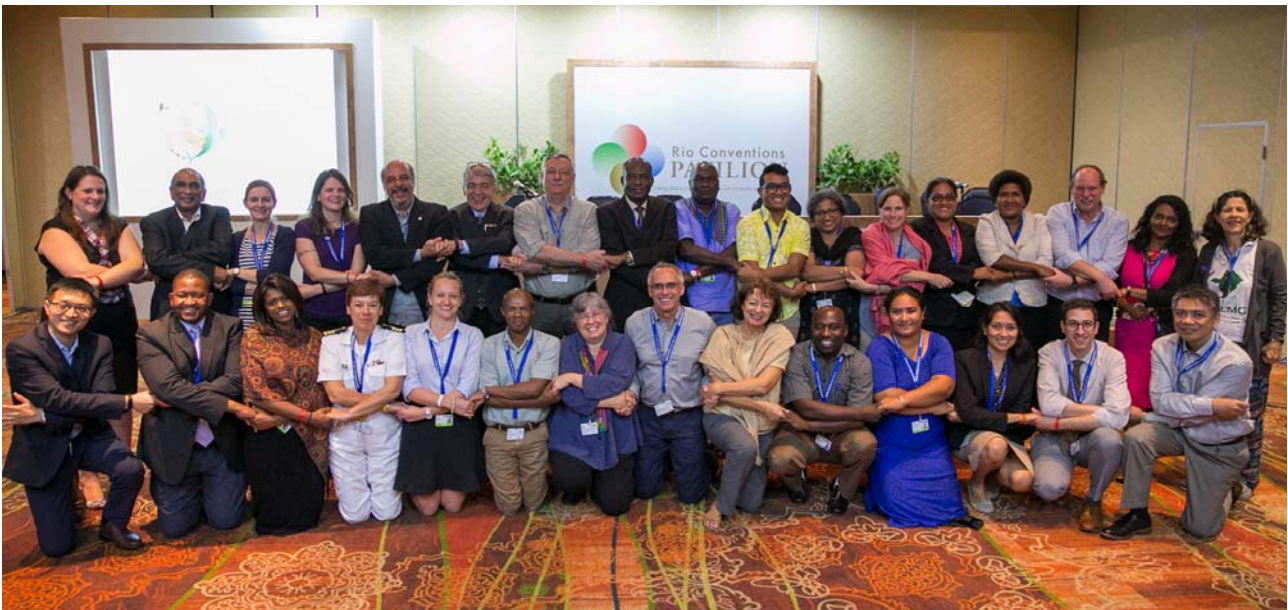
Partnership for Achieving Aichi Biodiversity Target 11.

area-based conservation measures (OECMs). OECMs offering conservation value in areas complementary to protected areas will provide many potential benefits for the elements of Target 11, provided these are well-defined and include measures that lead to long-term outcomes for the conservation of nature as a whole. There is some concern that too broad a definition may be applied, opening the possibility of including inappropriate land uses or management activities, or that the designation of OECMs may be used to avoid having to expand protected areas (Woodley et al., 2012; Jonas et al., 2014). Therefore, there is a need for specific guidance and an agreed upon working definition for OECMs to maximise their impacts. A Taskforce established through IUCN's World Commission on Protected Areas has begun the process of developing technical guidance on OECMs, including a draft screening tool, and discussion over the potential types of OECMs.